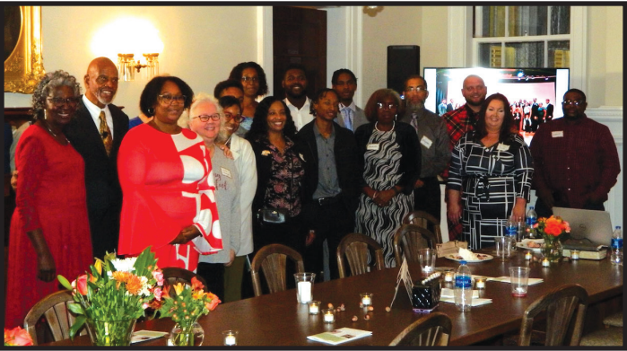
Dinner of gratitude FFF alumni, friends and sons