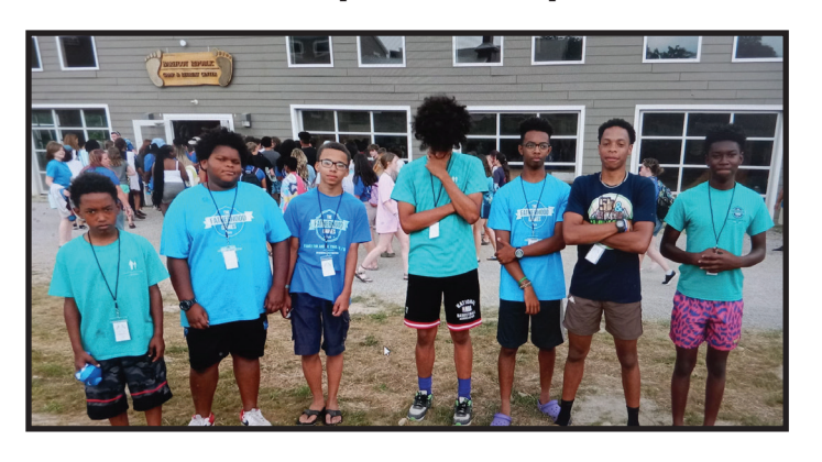
FFF sons upon arrival at the Barefoot Republic in Kentucky!

This is the Family Foundation Fund's 26th mentoring program Son Camp. Son Camp is the orientation into the FFF mentoring program. Young men become part of a team/family and they learn the importance of order, respect, honor and responsibility.