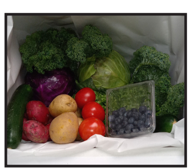
By purchasing share boxes, you support the mission of restoring fatherhood.

of labor and joy. It is a wonderful community gathering and a real-time experience of the body of believers across ethnic and socio-economic lines as one for a common cause...to strengthen family. We begin at 8:00 a.m. with prayer and conclude at 12:00 p.m. with lunch. Please email info@familyfoundationfund.org to register for the family day. We look forward to you joining us!!