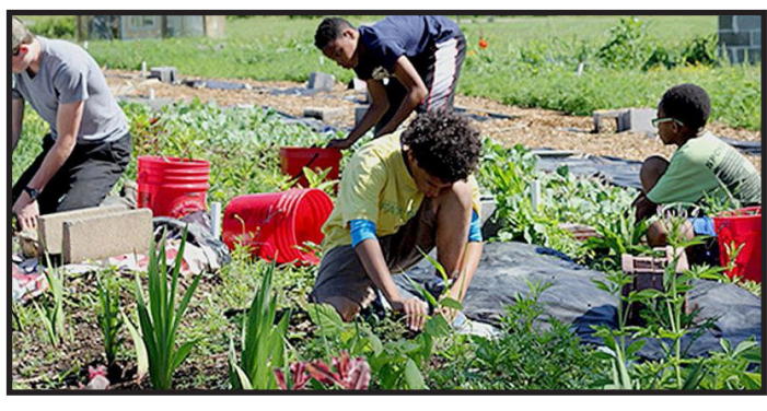
FFF Sons Working at SonShine Farms

If you would like to support the FFF program with your produce dollars, we would love to have you as a SonShine Farms share partner. Produce deliveries began in June. Each share box will have 12 plus pounds of produce...the produce is all grown organically and provides employment for our summer FFF sons, where they learn the value and responsibilities of work! Technology and the absence of father-son work opportunities have left most industries desperate for qualified dependable employees.