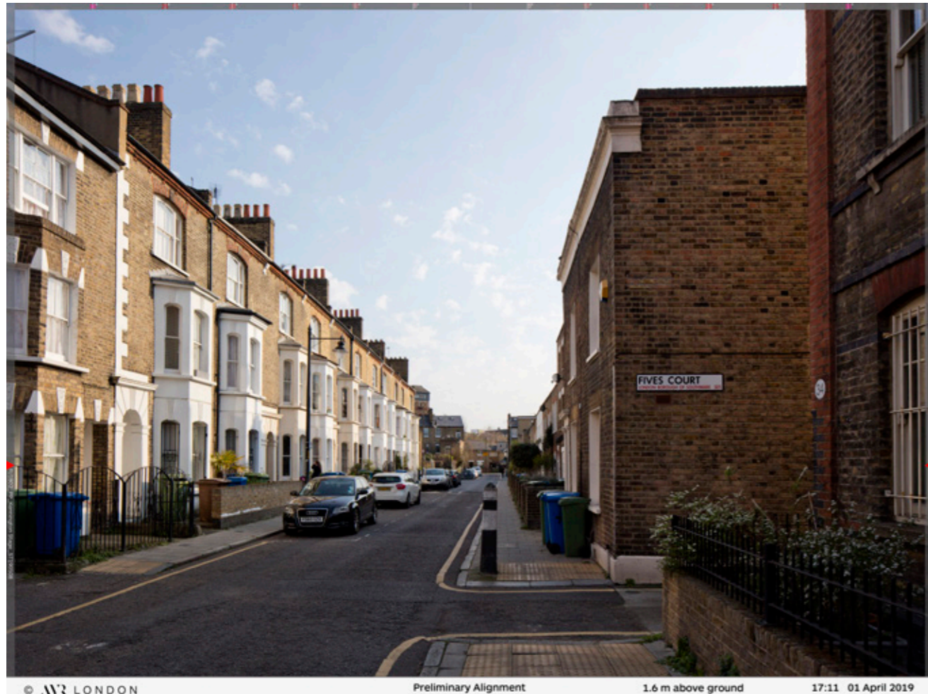
© AR LONDON Preliminary Alignment 1.6 m above ground 17:11 01 April 2019