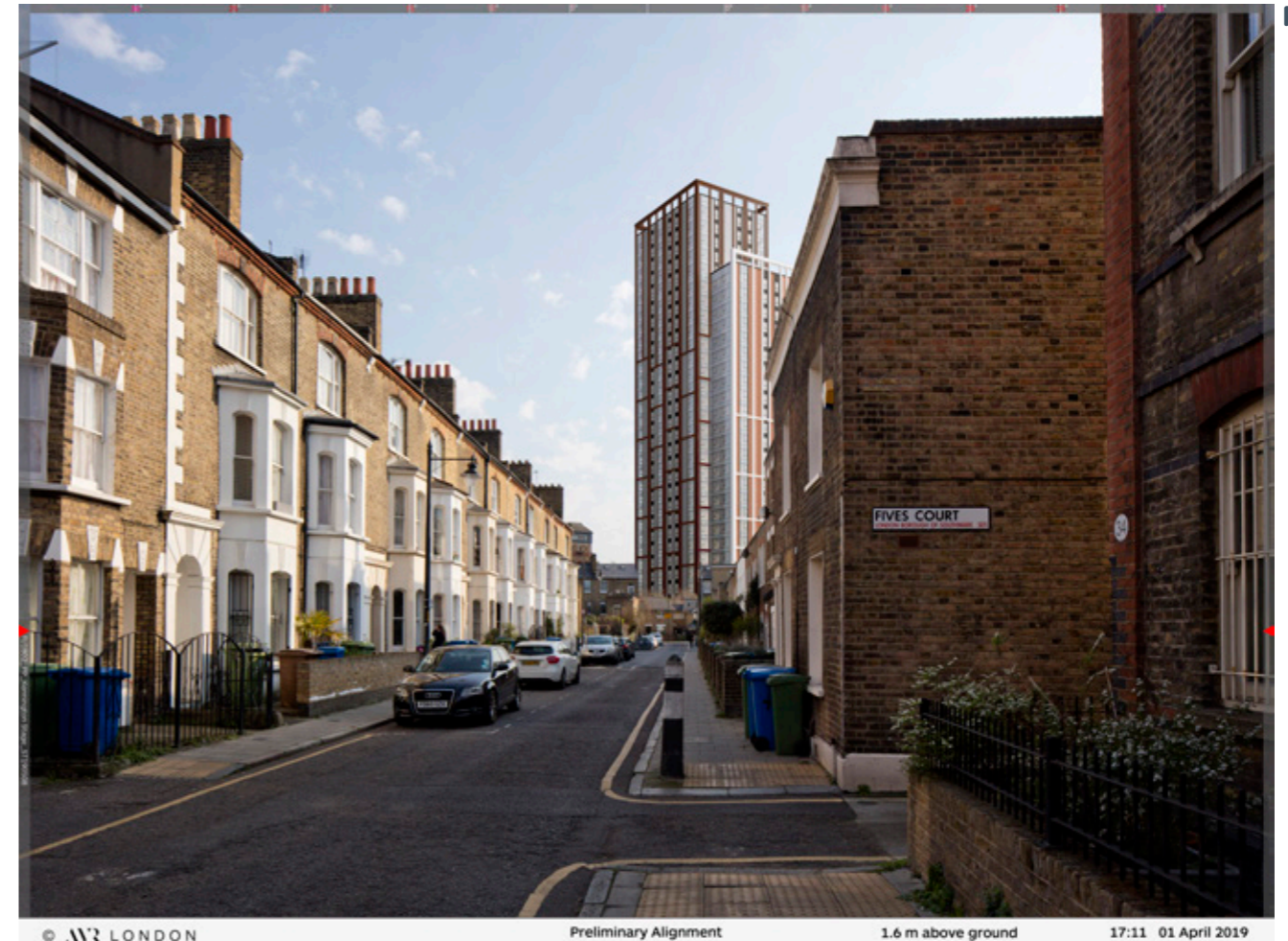
© AR LONDON Preliminary Alignment 1.6 m above ground 17:11 01 April 2019