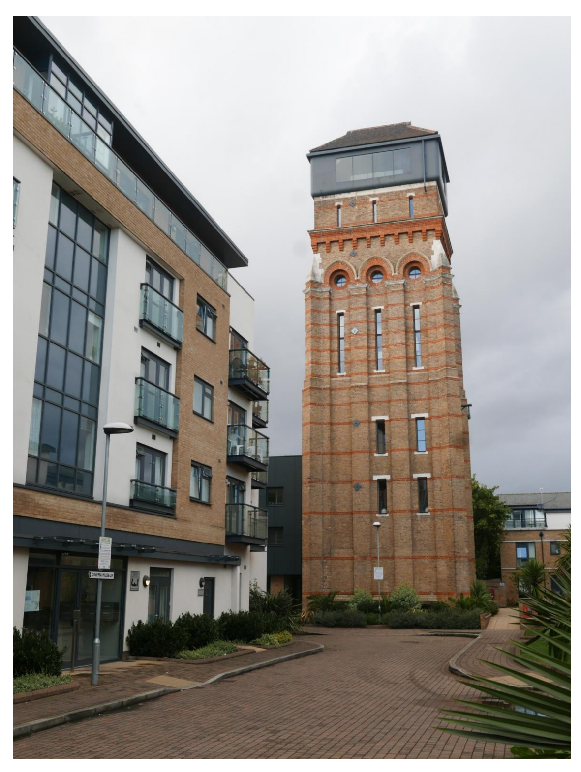
The listed former Water Tower of the former Lambeth Workhouse and Hospital. View from southeast showing its present distinctive and uninterrupted profile.