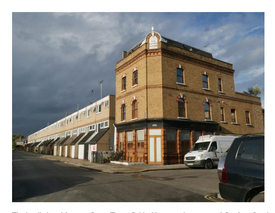
The locally listed former Court Tavern Public House at the corner of Renfrew Road and Dugard Way and the three-storey housing along the north-east side od of Renfrew Road. View from the south showing their present uninterrupted roof-lines.