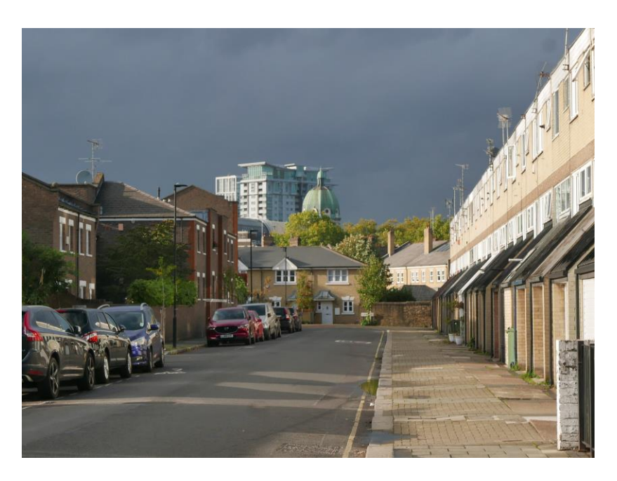
View northwards along Renfrew Road showing the damaging impact of new development on the distinctive profile of the central dome of the listed Imperial War Museum – compromising a major feature of significance - by poorly considered tall-building development.