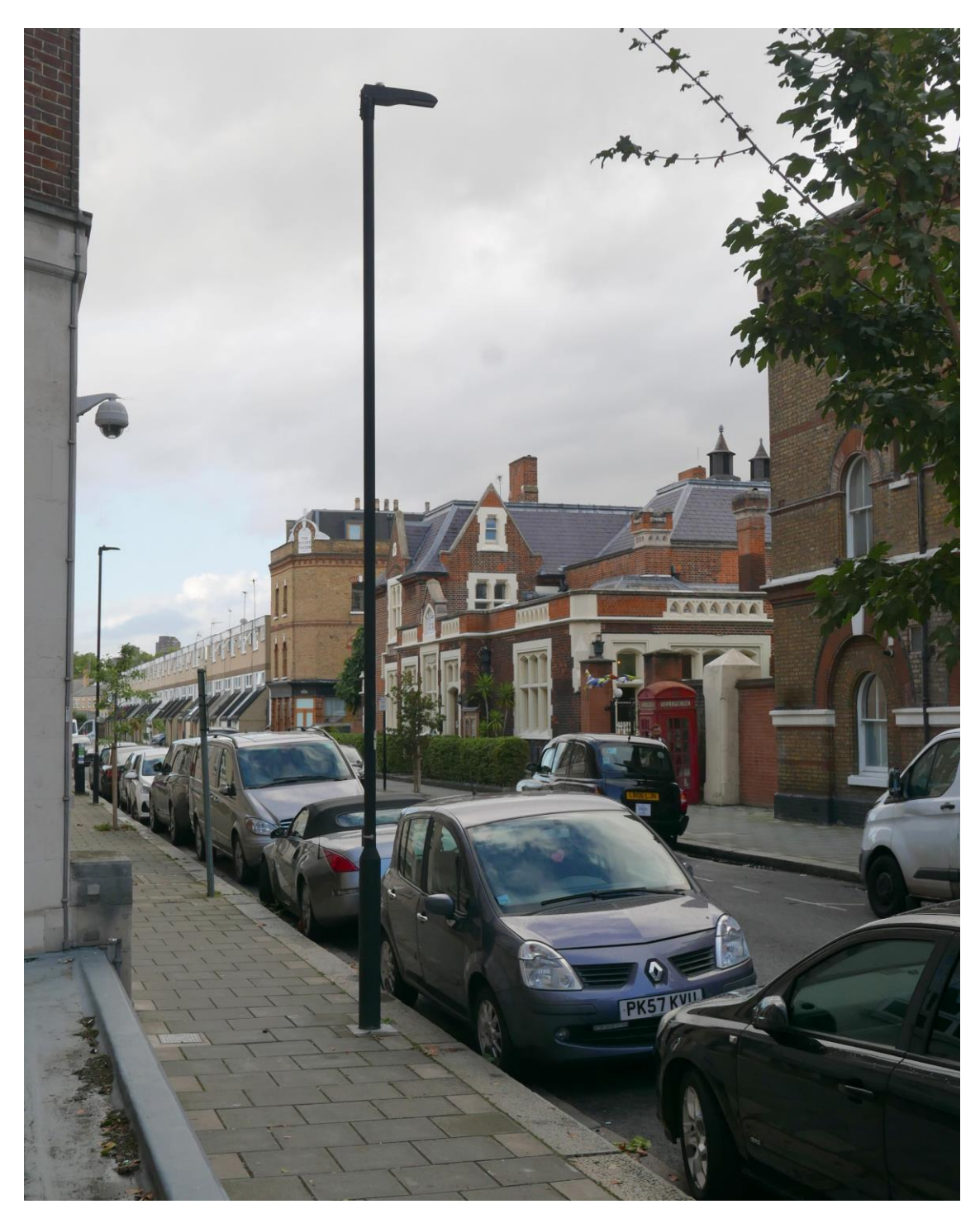
The locally former Court Tavern Public House, the listed former Magistrate's Courthouse and the listed former Fire Station in Renfrew Road. View from the south, showing their unbroken roof-lines.