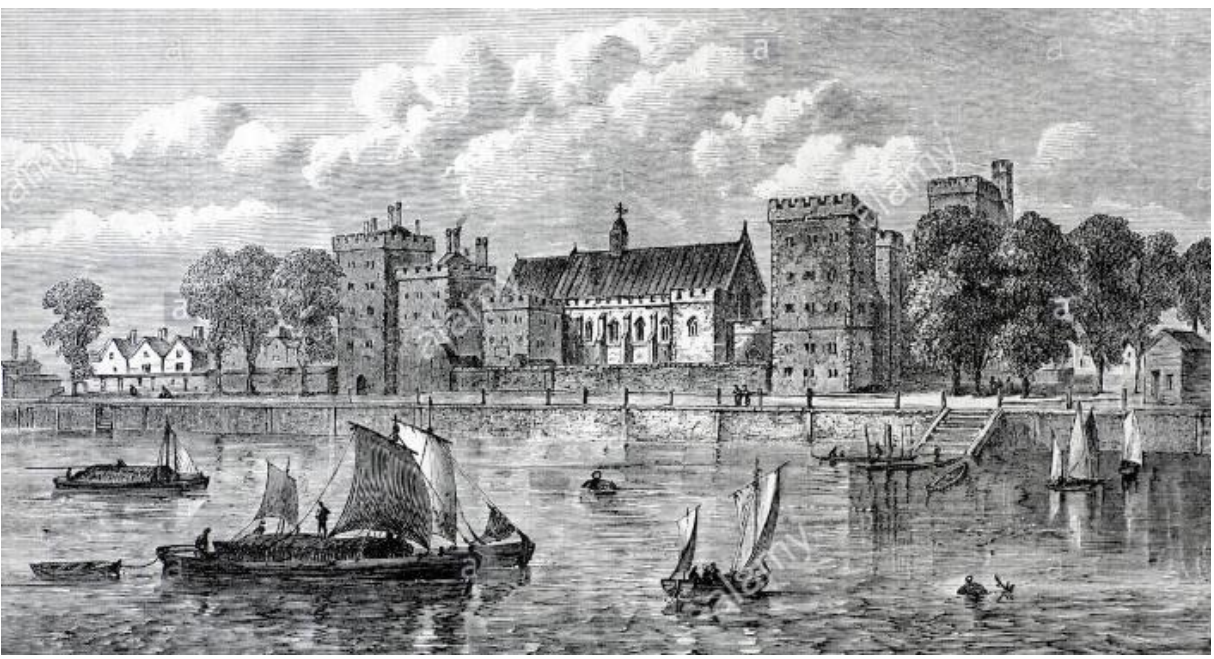
1709 (engraving of 1875)