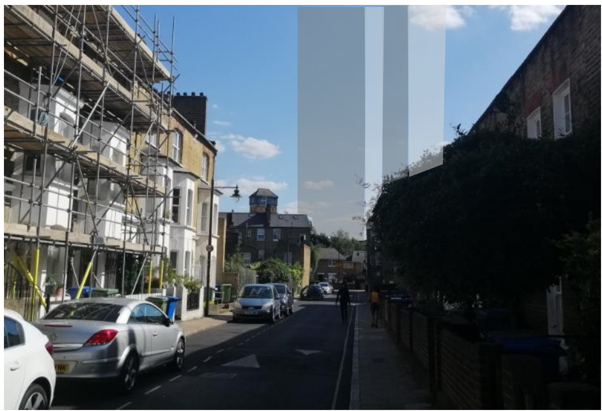
My estimation of the bulk and mass of the proposal is shaded in grey.