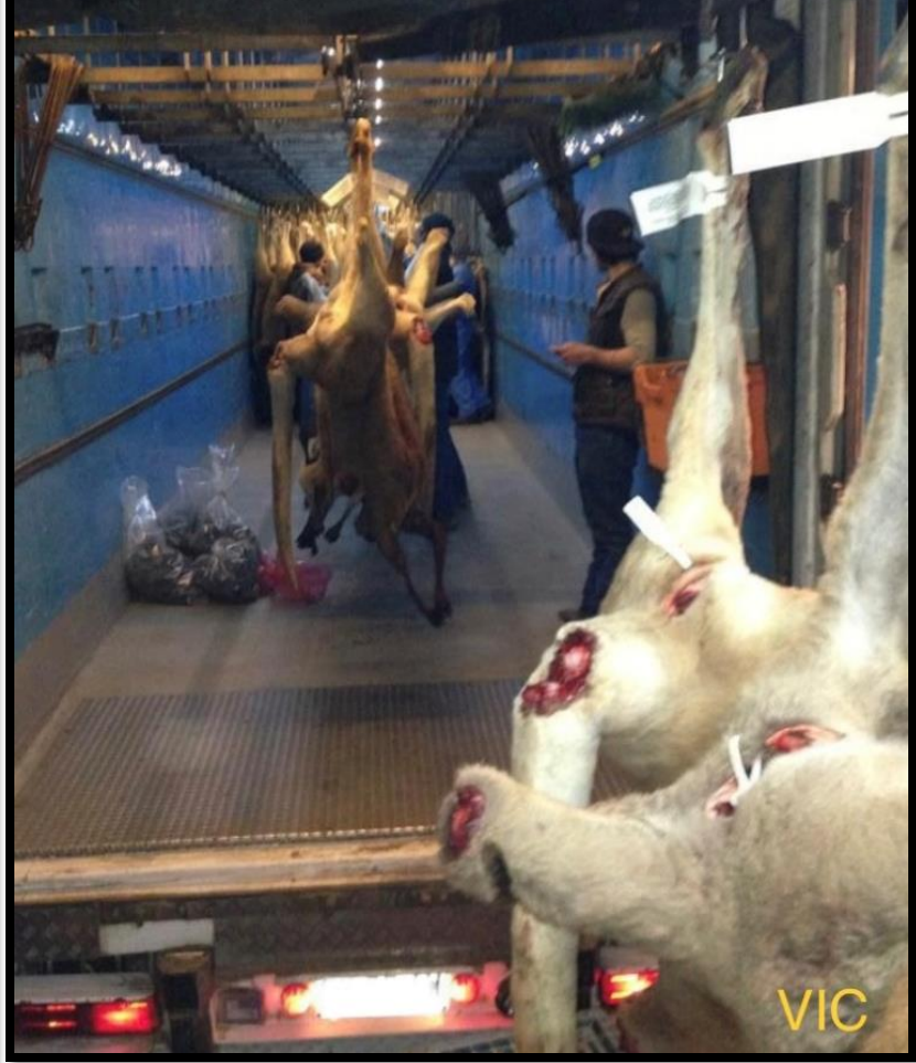
There are minimal hygiene standards. Note the lack of gloves and protective clothing.