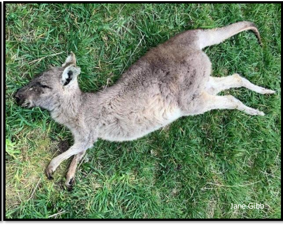
These joeys were orphaned after a commercial shoot. Despite rescue and the best care, their spirits and bodies were broken, and they did not survive.