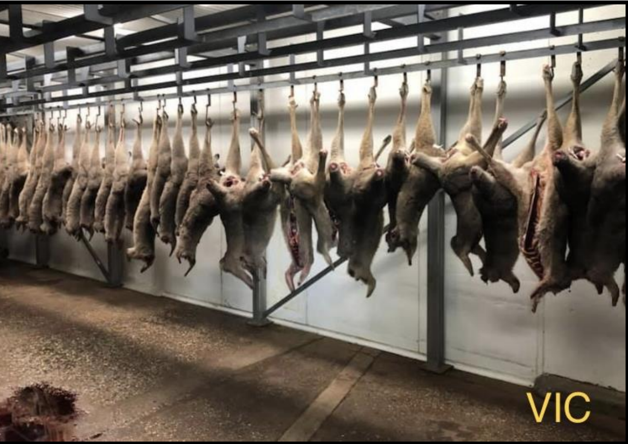
There is no minimum carcass weight in Victoria. Note the many small individuals.