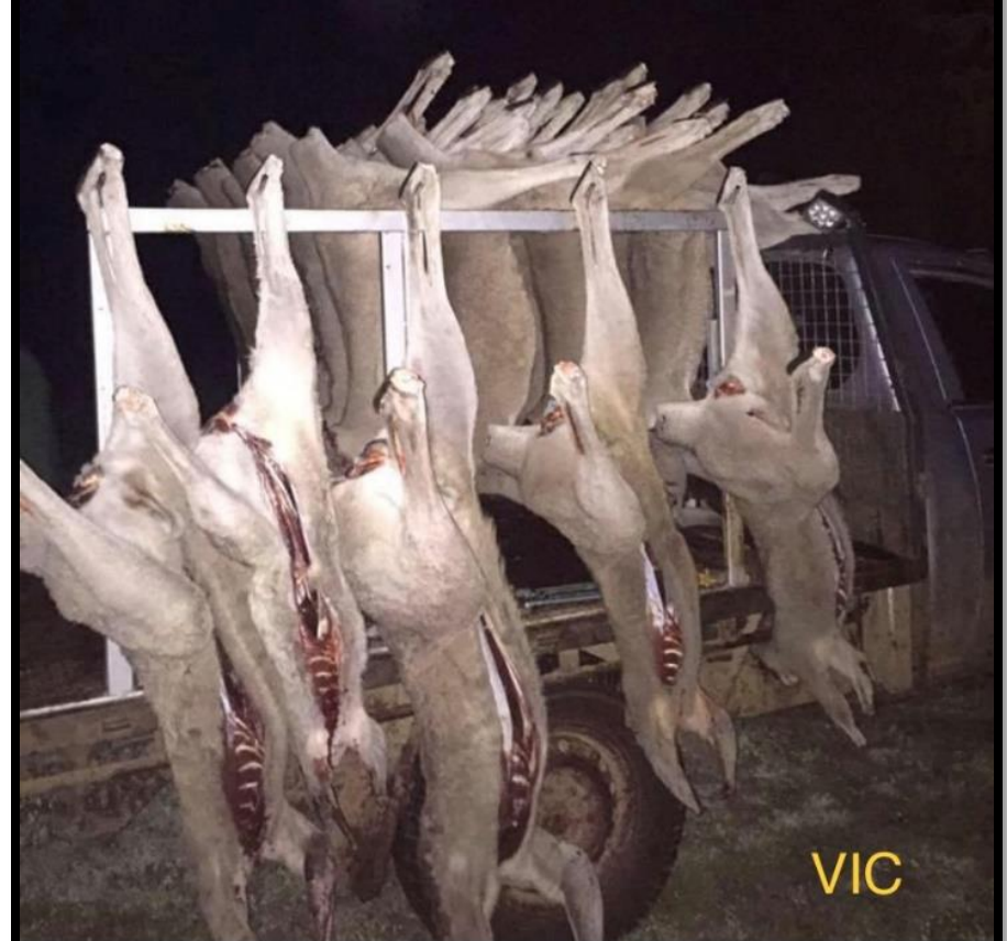
Cavities exposed to heat, dust and insects

Note the lack of gloves and protective clothing