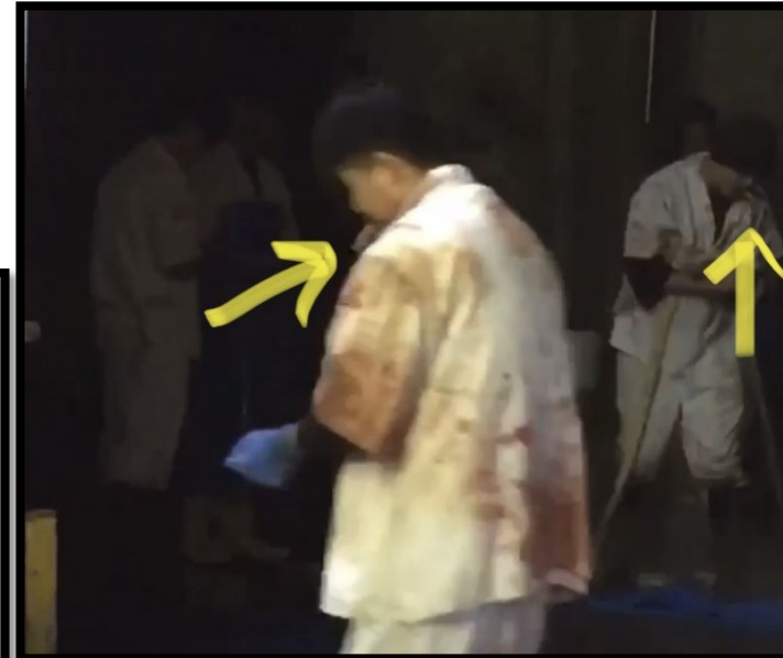
Workers apparently smoking & allegedly under the influence