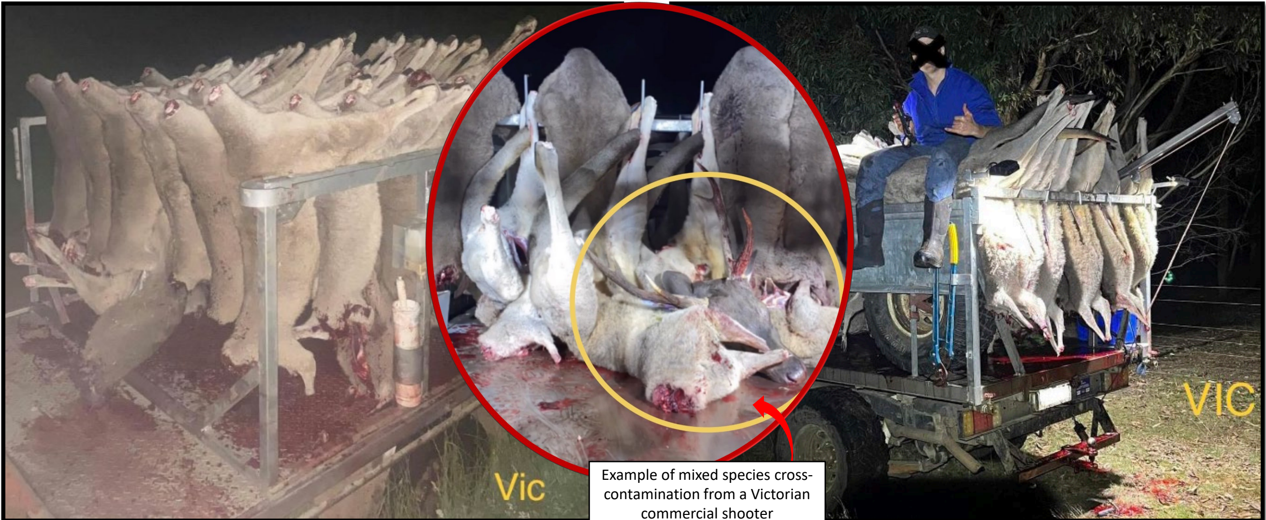
Example of mixed species cross-contamination from a Victorian commercial shooter

Kangaroos are packed tightly together, including with other wild species such as wild boar and deer. The open carcasses can be driven around all night with dust, mud, faeces, insects and high ambient temperatures. This is highly unhygienic and disturbing to members of the public .