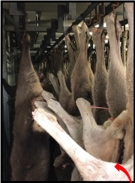
Deer and Kangaroos crammed together in onsite chillers. Video evidence shows a leaking roof.

These images from inside Victorian processors were leaked by a whistleblower who alleged mistreated workers smoke and drink alcohol in filthy conditions.