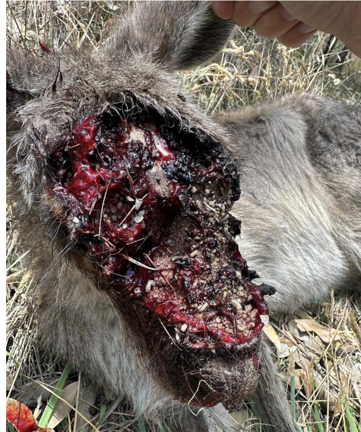
Sunday Creek, Vic. Jan, 2025. Found alive with joey.

Volunteer rescuers are left with the trauma of euthanising horrifically wounded kangaroos. In 2023, Wildlife Victoria reported a 55% increase in gunshot wounding-related cases since commercialisation. Despite the high number of reported cases, countless other kangaroos will escape to die slowly in the bush. Animal welfare organisations globally have declared the kangaroo industry a 'welfare crisis' .