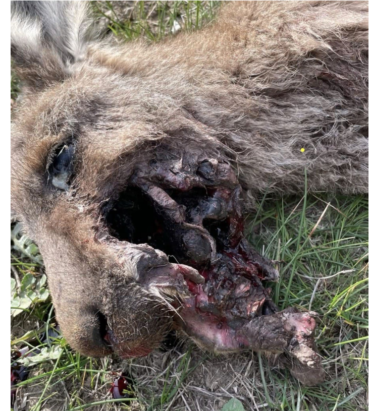
Dixons Creek, Vic. Sept, 2025. Found Alive.