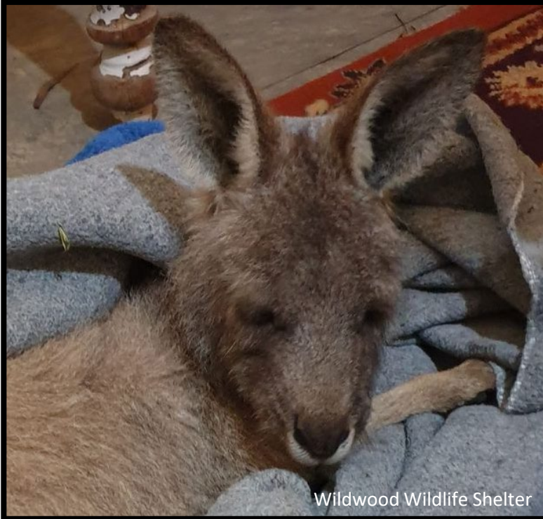
Wildwood Wildlife Shelter

Joeys are considered a waste product and pouch joeys will be decapitated or bashed to death. At-foot joeys often escape to perish slowly without maternal care.