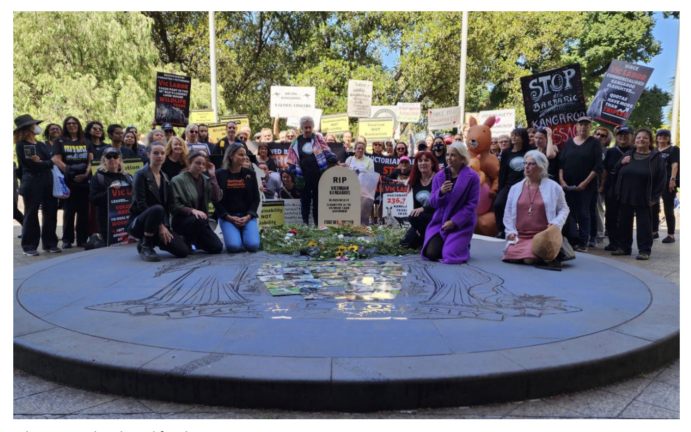
A large crowd gathered for the event