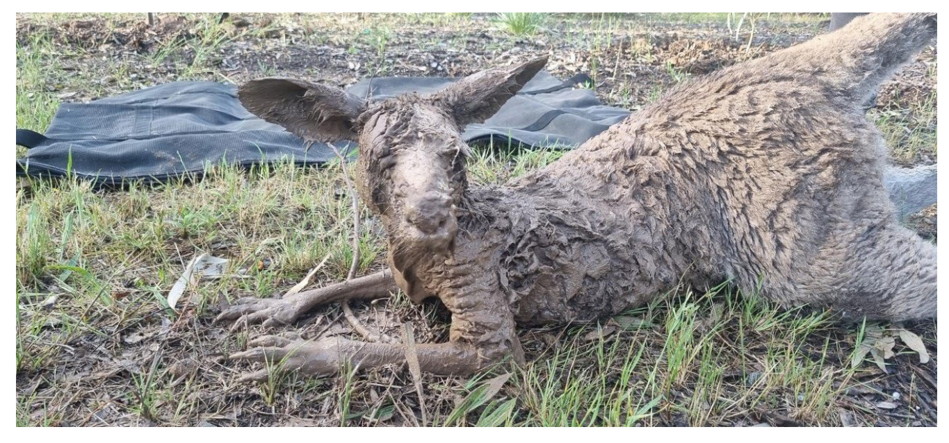
Young male kangaroo caked with mud after fleeing floodwaters in Kialla.