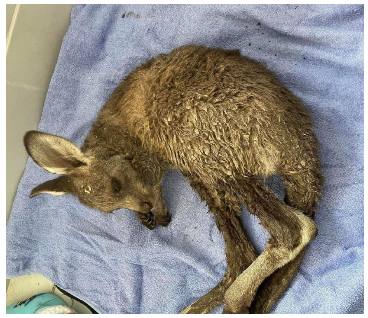
Her orphaned joey caked in mud, likely suffering from a respiratory infection from the mud and water.

An exhausted displaced mother kangaroo stuck in a fence with her face in the muddy water in Gisborne. She was euthanised and her joey taken into care.