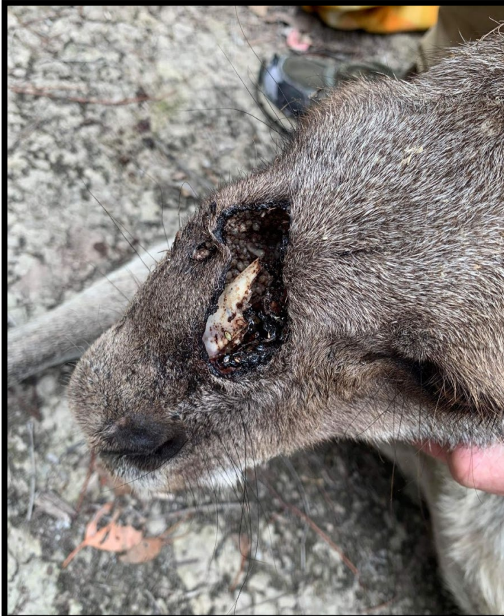
Panton Hill, Vic. Found alive.