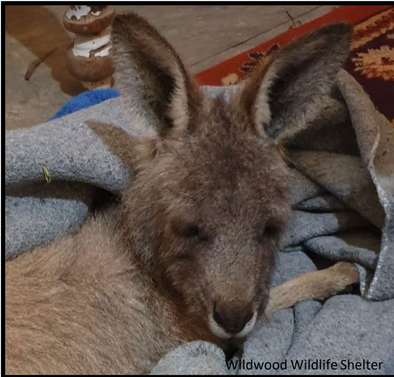
Wildwood Wildlife Shelter

Joeys are considered a waste product and pouch joeys will be bashed to death. At-foot joeys often escape to perish slowly, crying for their mothers.