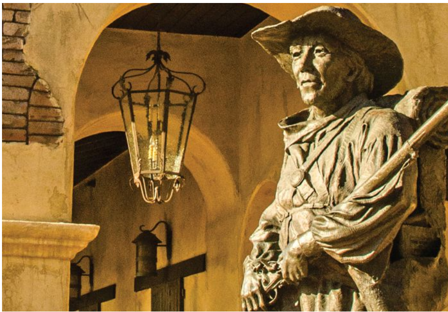
SAINTS AND SOLDIERS: [Above and right] Mormon Battalion Historic Site honors the Latter-day Saint men and women who served the US Army during the Mexican–American War. Equipped at Fort Leavenworth, Kansas, in August of 1846, they marched nearly two thousand miles, passing through Santa Fe, New Mexico, and Tucson, Arizona, before arriving in San Diego on January 29, 1847.