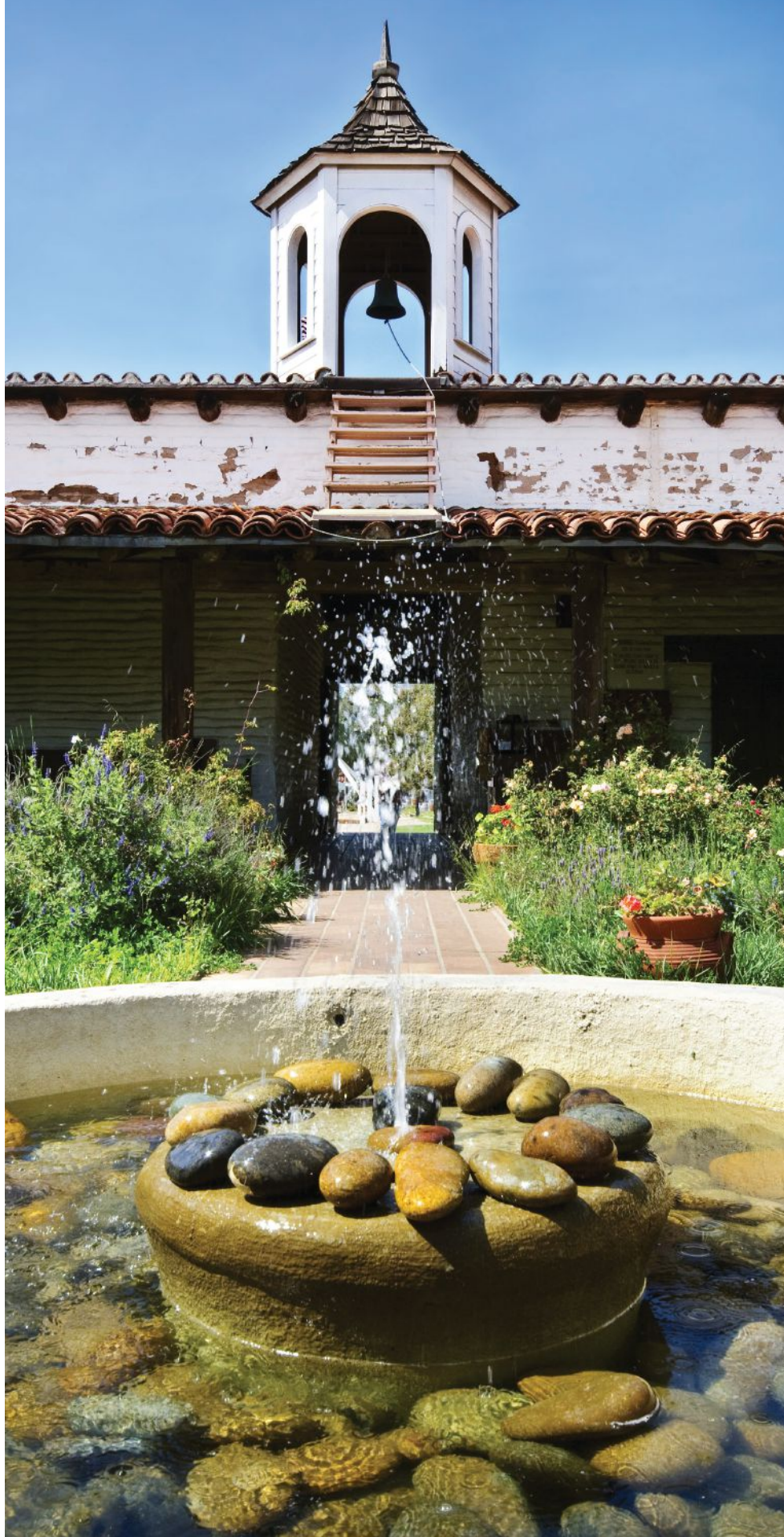
Old Town San Diego • 4002 Wallace Street • San Diego, California 92110 • (619) 220-5422 • oldtownsandiego.org