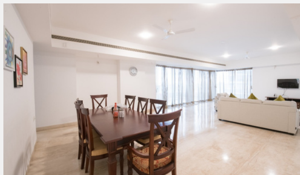
Hall & Dining