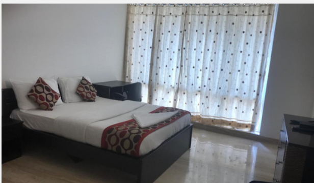
Bedroom - 4