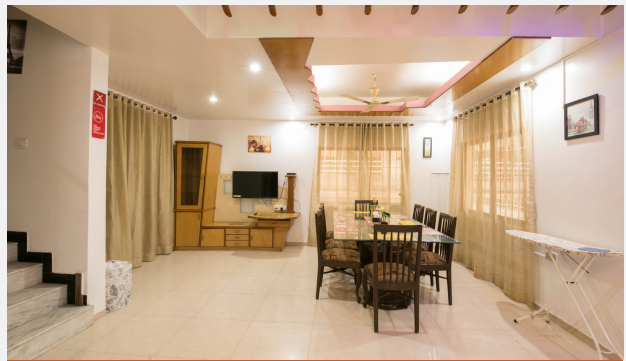
Hall & Dining