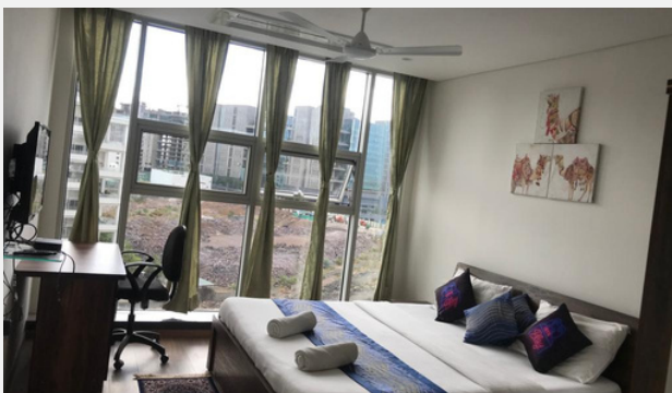
Bedroom - 4