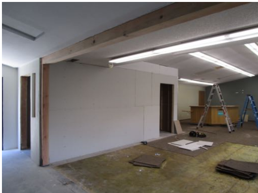
Offices & Interior Refresh