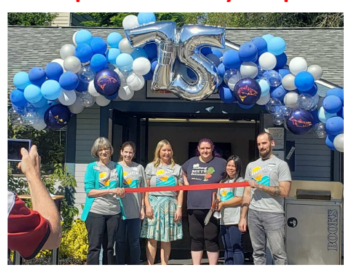
Celebrating 75 Years of Service & Summer Programs Begin !!