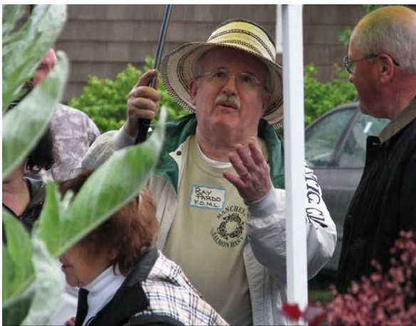
Salmon Bake, June 22, 2010.

https://www.kitsapsun.com/obituaries/pbks1304332