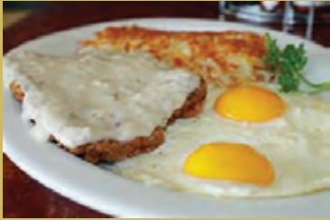
CHICKEN FRIED STEAK & EGGS 16.99

Sautéed pork in a chile verde sauce with 3 eggs, rice, beans and warm tortillas. 16.99