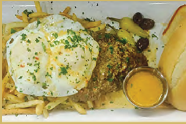
PORTUGUESE STEAK & EGGS Top sirloin marinated in a Portuguese garlic sauce, two basted eggs, fries & cheese bread. 19.99