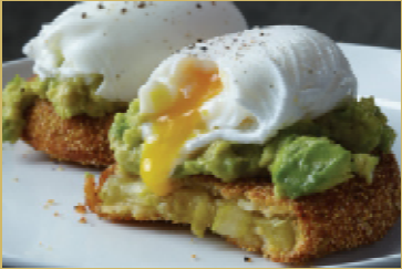
FRIED GREEN TOMATOES Cornmeal breaded fried green tomatoes topped with avocado and two poached eggs, served with hashbrowns. 15.99