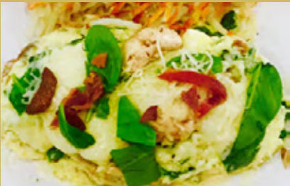
SPINACH, BACON & MUSHROOM OMELETTE A hearty omelette filled with spinach, bacon, mushrooms, topped with jack cheese. 15.49