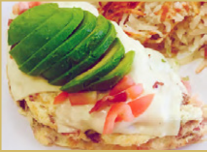
HUNNYS OMELETTE Bacon, tomato and Swiss cheese topped with avocado. 15.49

Our hearty egg omelettes are served with your choice of hashbrowns, home-fried potatoes or fresh fruit and your choice of toast or English muffin. Make any omelette with egg whites for .99 extra