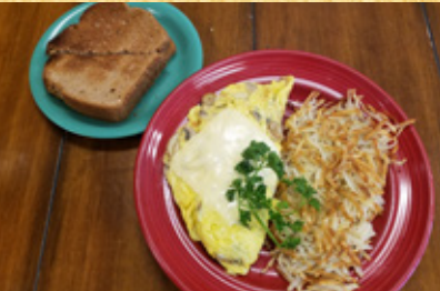
MUSHROOM & CHEESE OMELETTE Fresh mushrooms topped with Swiss cheese. 14.49

A hearty omelette! Fresh bell pepper, onion and ham, topped with American cheese. 14.49