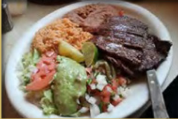
CARNE ASADA & EGGS Marinated carne asada with 3 eggs, rice, beans, and warm tortillas. 19.99