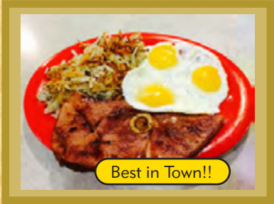
HAM & EGGS 16.99

USDA choice top sirloin cooked to your liking.