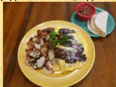
CARNE ASADA OMELETTE Carne asada topped with pepperjack cheese. 17.99