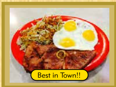
HAM & EGGS 15.99