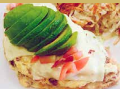
HUNNYS OMELETTE Bacon, tomato and Swiss cheese topped with avocado. 14.99