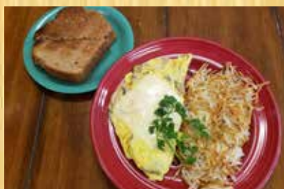
MUSHROOM & CHEESE OMELETTE Fresh mushrooms topped with Swiss cheese. 13.99