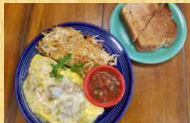
CHILI VERDE OMELETTE Sautéed pork, chili verde sauce and topped with jack cheese. 15.99