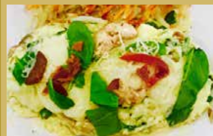
SPINACH, BACON & MUSHROOM OMELETTE A hearty omelette filled with spinach, bacon, mushrooms, topped with jack cheese. 14.99

Our hearty egg omelettes are served with your choice of hashbrowns, home-fried potatoes or fresh fruit and your choice of toast or English muffin. Make any omelette with egg whites for .99 extra