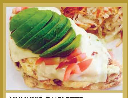
HUNNY'S OMELETTE Bacon, tomato and Swiss cheese topped with avocado. 13.99