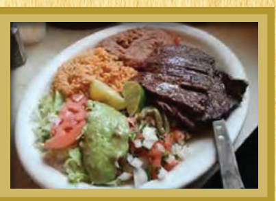
CARNE ASADA & EGGS Marinated carne asada with 3 eggs, rice, beans, and warm tortillas. 16.99

PORTUGUESE STEAK & EGGS 8 oz sirloin steak marinated in a Portuguese garlic sauce, two basted eggs, fries & French roll. 16.99