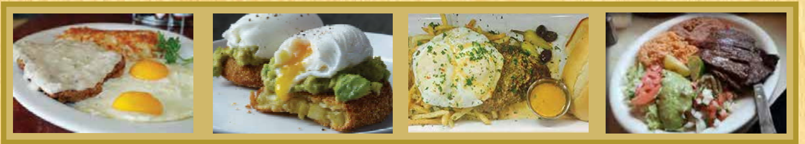
CHICKEN FRIED STEAK & EGGS 15.99