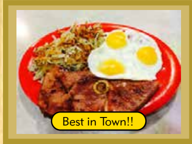
HAM & EGGS 15.99