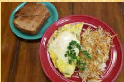
MUSHROOM & CHEESE OMELETTE Fresh mushrooms topped with Swiss cheese. 13.99

DENVER CHEESE OMELETTE A hearty omelette! Fresh bell pepper, onion and ham, topped with American cheese. 13.99