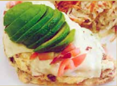
HUNNYS OMELETTE Bacon, tomato and Swiss cheese topped with avocado. 14.99

VEGGIE OMELETTE A harvest of seasonal vegetables, sliced mushrooms, tomatoes, onions, avocado, bell peppers, topped with Swiss cheese. 14.49