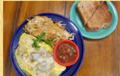
CHILI VERDE OMELETTE Sautéed pork, chili verde sauce and topped with jack cheese. 15.99

RANCH OMELETTE Bacon, sausage, ham, bell peppers, tomatoes, and onions, topped with jack and cheddar cheese. 14.99