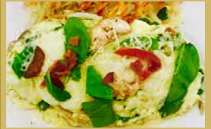
SPINACH, BACON & MUSHROOM OMELETTE A hearty omelette filled with spinach, bacon, mushrooms, topped with jack cheese. 14.99

Our hearty egg omelettes are served with your choice of hashbrowns, home-fried potatoes or fresh fruit and your choice of toast or English muffin. Make any omelette with egg whites for .99 extra