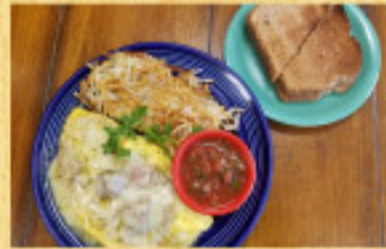
CHILI VERDE OMELETTE Sautéed pork, chili verde sauce and topped with jack cheese. 16.99