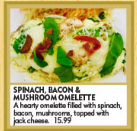
SPINACH, BACON & MUSHROOM OMELETTE A hearty omelette filled with spinach, bacon, mushrooms, topped with jack cheese. 15.99

Our hearty egg omelettes are served with your choice of hashbrowns, home-fried potatoes or fresh fruit and your choice of toast or English muffin. Make any omelette with egg whites for 1.29 extra