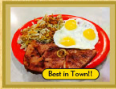
HAM & EGGS 16.99