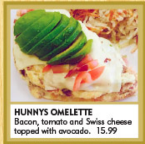
HUNNYS OMELETTE Bacon, tomato and Swiss cheese topped with avocado. 15.99