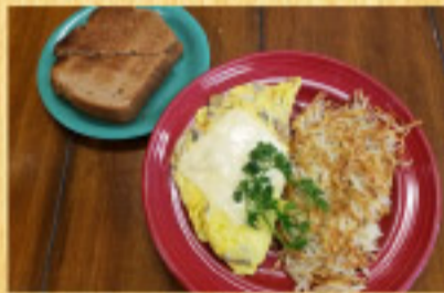
MUSHROOM & CHEESE OMELETTE Fresh mushrooms topped with Swiss cheese. 14.99