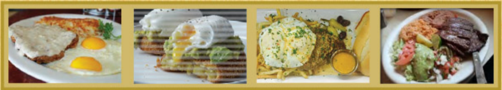
CHICKEN FRIED STEAK & EGGS 17.99