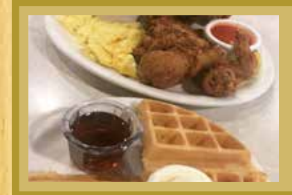
CHICKEN & WAFFLES Half of a fried chicken or 4 piece chicken strips, waffles, smothered potatoes and 2 eggs. 24.99

2 pork chops seasoned and dusted in flour, grilled to perfection. 20.99