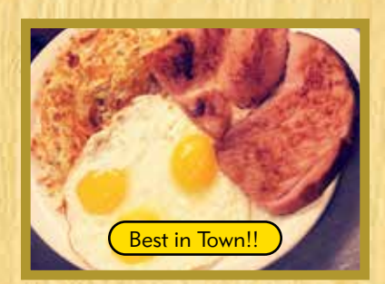
HAM & EGGS 18.99

Served with refried beans, Spanish rice and choice of corn or flour tortillas. 15.99