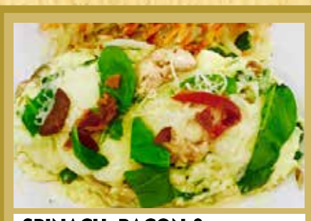
SPINACH, BACON & MUSHROOM OMELETTE A hearty omelette filled with spinach, bacon, mushrooms, topped with jack cheese. 17.99

Our hearty egg omelettes are served with your choice of hashbrowns, home-fried potatoes or fresh fruit and your choice of toast or English muffin. Make any omelette with egg whites for 1.99 extra