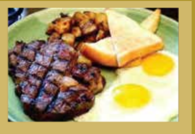
RIBEYE STEAK & EGGS Marinated ribeye steak, 3 eggs, hashbrowns & toast. 30.99

PORTUGUESE STEAK & EGGS Strip steak marinated in a Portuguese garlic sauce, two basted eggs, fries & French roll. 19.99