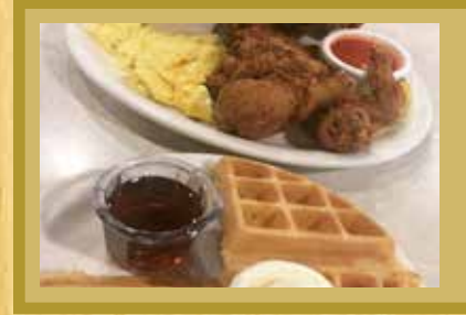
CHICKEN & WAFFLES Half of a fried chicken or 4 piece chicken strips, waffles, smothered potatoes and 2 eggs. 19.99

PORK CHOPS & EGGS 2 pork chops seasoned and dusted in flour, grilled to perfection. 18.99