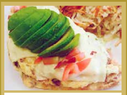
HUNNY'S OMELETTE Bacon, tomato and Swiss cheese topped with avocado. 14.99