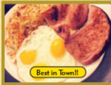
HAM & EGGS 19.99

Served with refried beans, Spanish rice and choice of corn or flour tortillas. 16.99