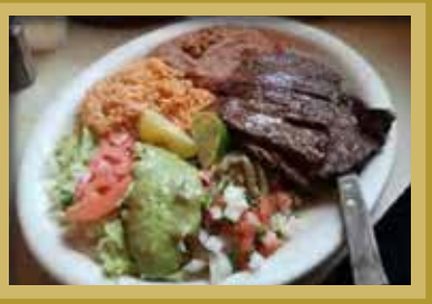
CARNE ASADA & EGGS Marinated carne asada with 3 eggs, rice, beans, and warm tortillas. 16.99