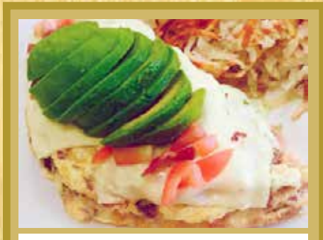
HUNNYS OMELETTE Bacon, tomato and Swiss cheese topped with avocado. 13.99