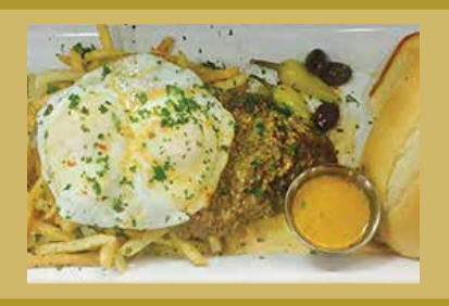
PORTUGUESE STEAK & EGGS Top sirloin marinated in a Portuguese garlic sauce, two basted eggs, fries & cheese bread. 16.99

FRIED GREEN TOMATOES Cornmeal breaded fried green tomatoes topped with avocado and two poached eggs, served with hashbrowns. 14.99