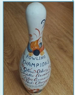
Bowling Trophy painted by Esther Nygaard