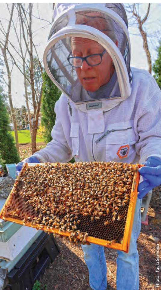
Worker bees are tending to their new brood on this egg and larvae hatchery frame. Honey is not produced on this frame.