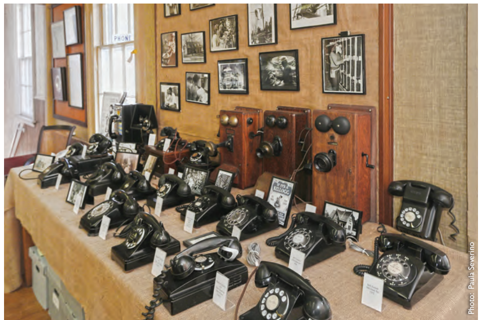
Vintage telephones from various time periods on display at the Academy Museum.

Enter, the switchboard. To the ordinary citizen it appeared to be little more than carriage bolts, teapot handles, and bustle wire. Oh my. The concept