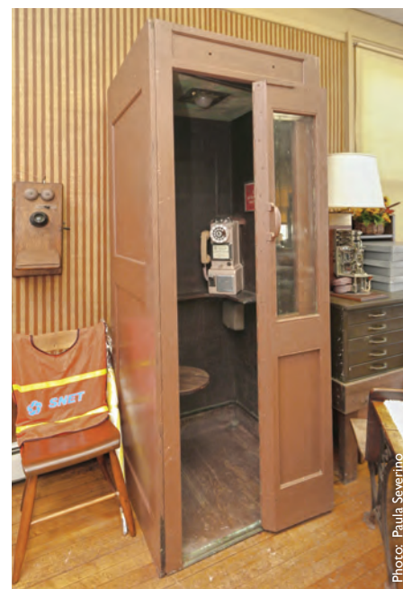
A 1930s - 1940s wooden telephone booth.

Southern New England Telephone Company continued to broaden their services which included Caller I.D. and CustomLink, a service for residence use of 800 numbers. J.D. Power and Associates rated the company as the "number one rated long-distance company in America," but its success would not continue, as a transaction was announced in 1998 to merge this successful endeavor with SBC Communications, Inc. out of Texas. Although the operating headquarters remained in Connecticut with the S.N.E.T. name, the company officially came to the end of its days as an independent telecommunications service provider.