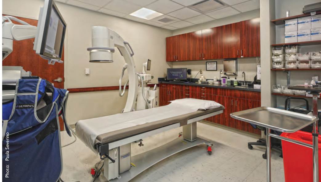
The facility's Fluoroscopy suite. The Fluoroscopy machine is used to capture continuous, moving images which is used to assist in procedures.