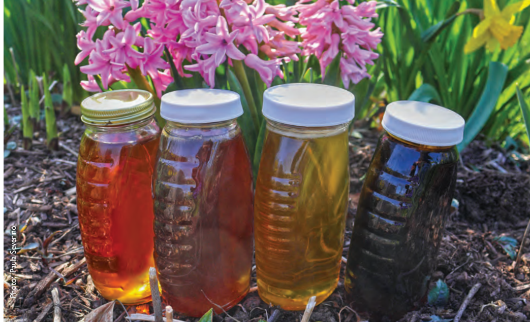
Riecker’s collection of honey - summer, fall, and spring, as well as lantern fly (the darkest), with each one having a different taste and color.

Depending on the season, the honey will look and taste different. Spring honey, for example, is lighter in color, pleasant-tasting, and mild. Summer honey is darker and full-bodied. When bees have foraged on the nectar of fall flowers like aster and golden rod, fall is even darker.