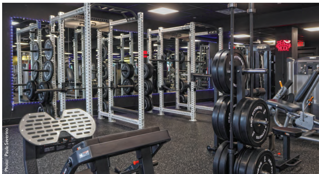
A view of the squat cages, which are only a fraction of the strengthening equipment offered.