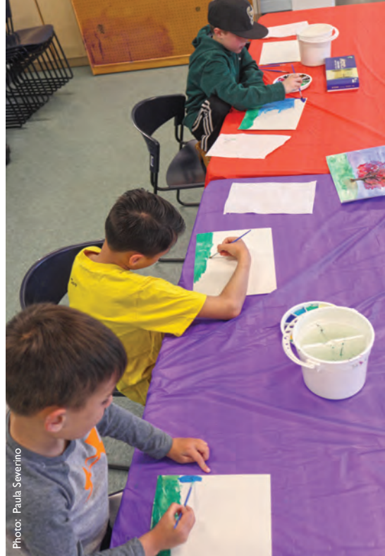
Children taking a watercolor class hosted by Youth Services during spring break.