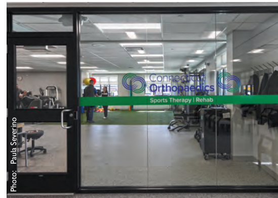
A view into the on-site sports therapy and rehab gym, which contains all the equipment needed to get patients back to where they need to be.