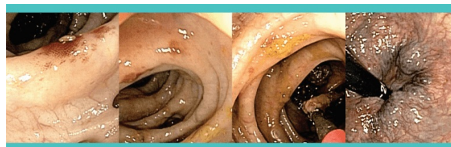
Diverticula Sigmoid colon