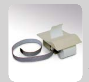
Impact Printer Records and prints critical sterilization cycle data, including chamber temperature and pressure, cycle elapsed times, and program cycle type.