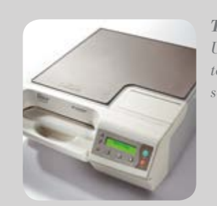
Top Cover Protector Use the cover protector to shield the M3 top from scratches or damage.