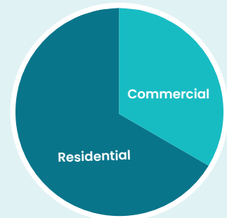
Oak Brook Assessed Valuation

Oak Brook is uniquely able to avoid a municipal property tax due to the strong sales tax revenue generated by our retail sector which exceeded $24,000,000 in 2022. If our sales tax revenue was cut in half, we'd likely need to replace it with an equivalent property tax, or about $12,000,000. Of that property tax, $8,000,000 would be paid by our residents and $4,000,000 by our business community.