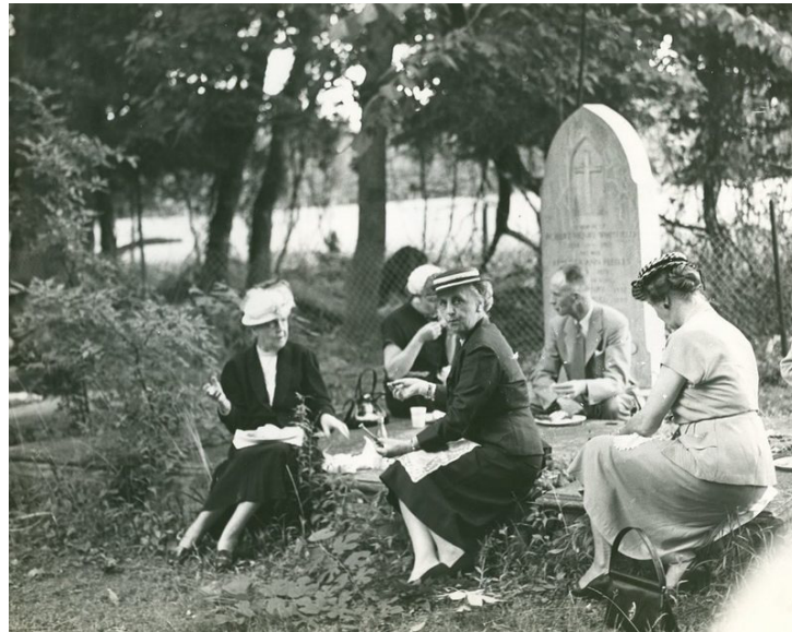
St. Lukes, Smithfield, VA 1957