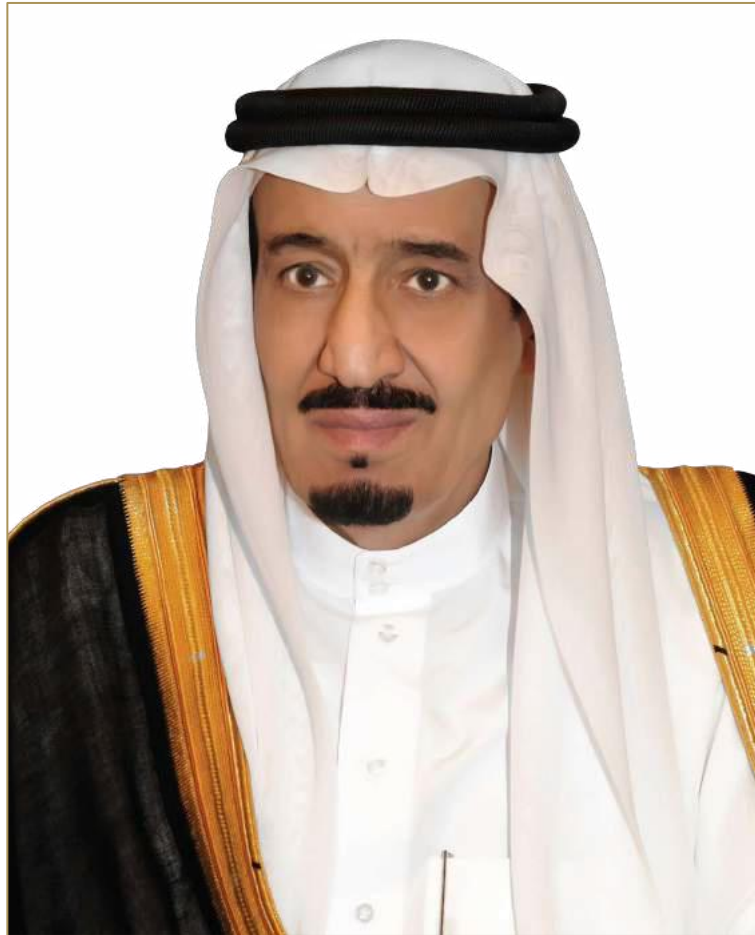
The Custodian of the Two Holy Mosques King Salman bin Abdulaziz Al Saud