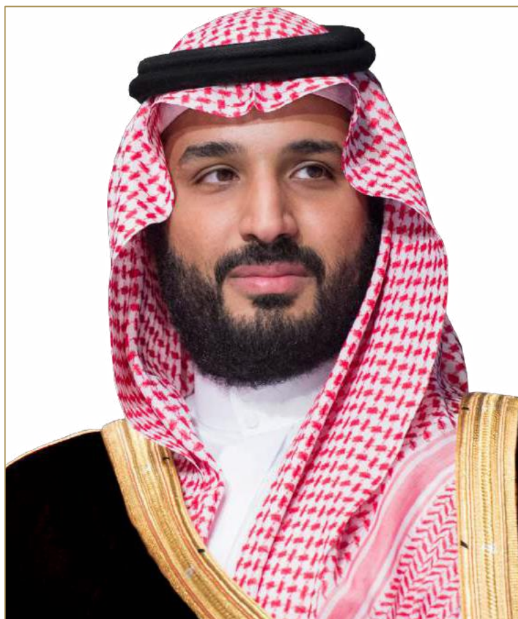
His Royal Highness Mohammed bin Salman bin Abdulaziz Al Saud Crown Prince, Prime Minister, and Chairman of the Council of Economic and Development Affairs

It is my pleasure to present Saudi Arabia's Vision for the future. It is an ambitious yet achievable blueprint, which expresses our long-term goals and expectations and reflects our country's strengths and capabilities. All success stories start with a vision, and successful visions are based on strong pillars.