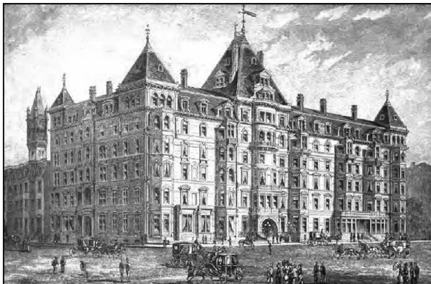
Hotel Vendome in Boston as it appeared circa 1880.