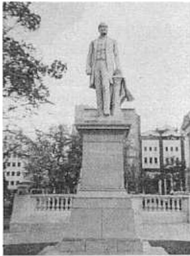
Sir Edward James Harland Engineer and Shipbuilder And M.P. for Belfast-North 1895

Prior to meeting the Mayor of Belfast, the group of Harlans gathered on the grounds of City Hall and had our photo taken in front of an imposing statue with this inscription: