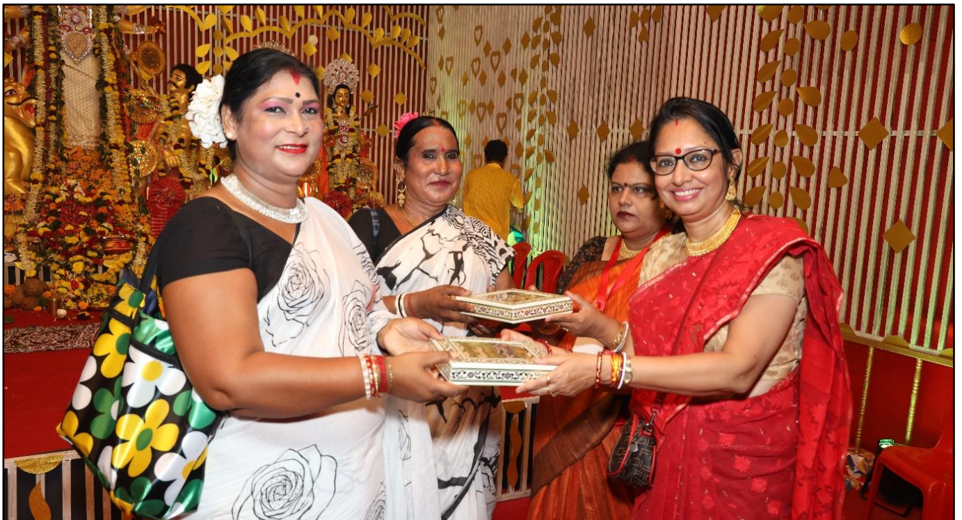
All activities of Banga Maitri Sansad are premised on the value inclusivity and equality. BMS welcomed members of the LGBTQ family to its Durga Puja-2022 with open arms and presented sweets and gifts as a mark of honour and respect to every human being, irrespective of their cast, creed, colour or gender orientation.