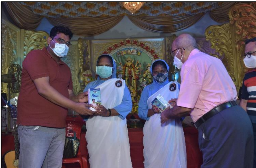
108 litres of milk tetra packets as donated to Mothers Teresa's Roses for feeding the homeless 2021 Durga Puja.