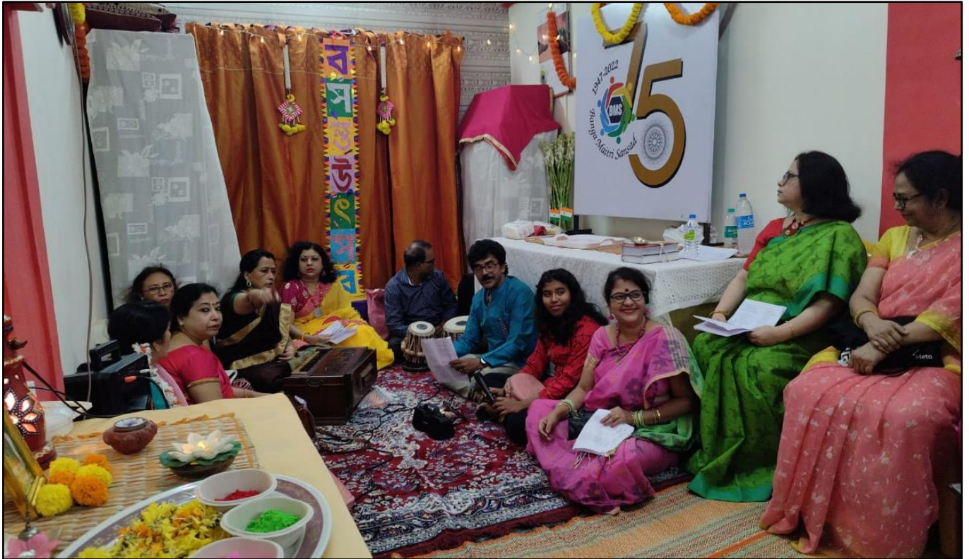
A musical baithaki to celebrate Vasant Utsav (Holi milan ) at the BMS premises in Vakola.