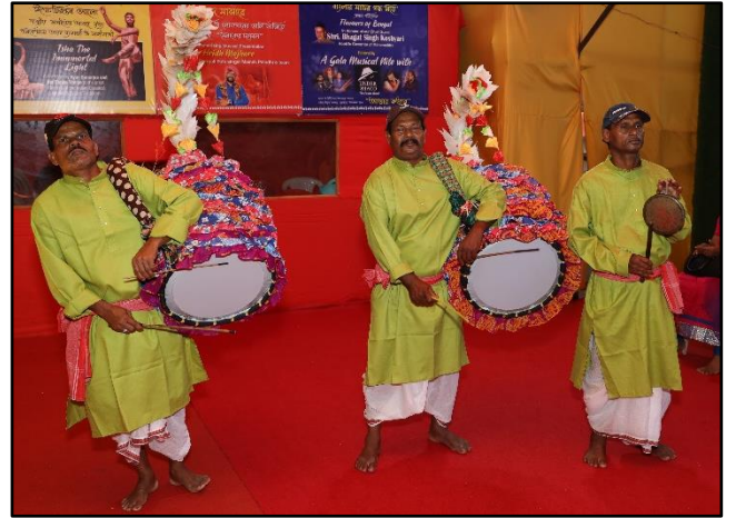
Monetary aid was provided to the dhaakis in 2021. In 2022, BMS donated new clothes and financial aid to them ( left photo ). Dhakis playing their dhaak (traditional drum) in their new clothes at the 75 th Durga Puja in 2022 ( right photo ).