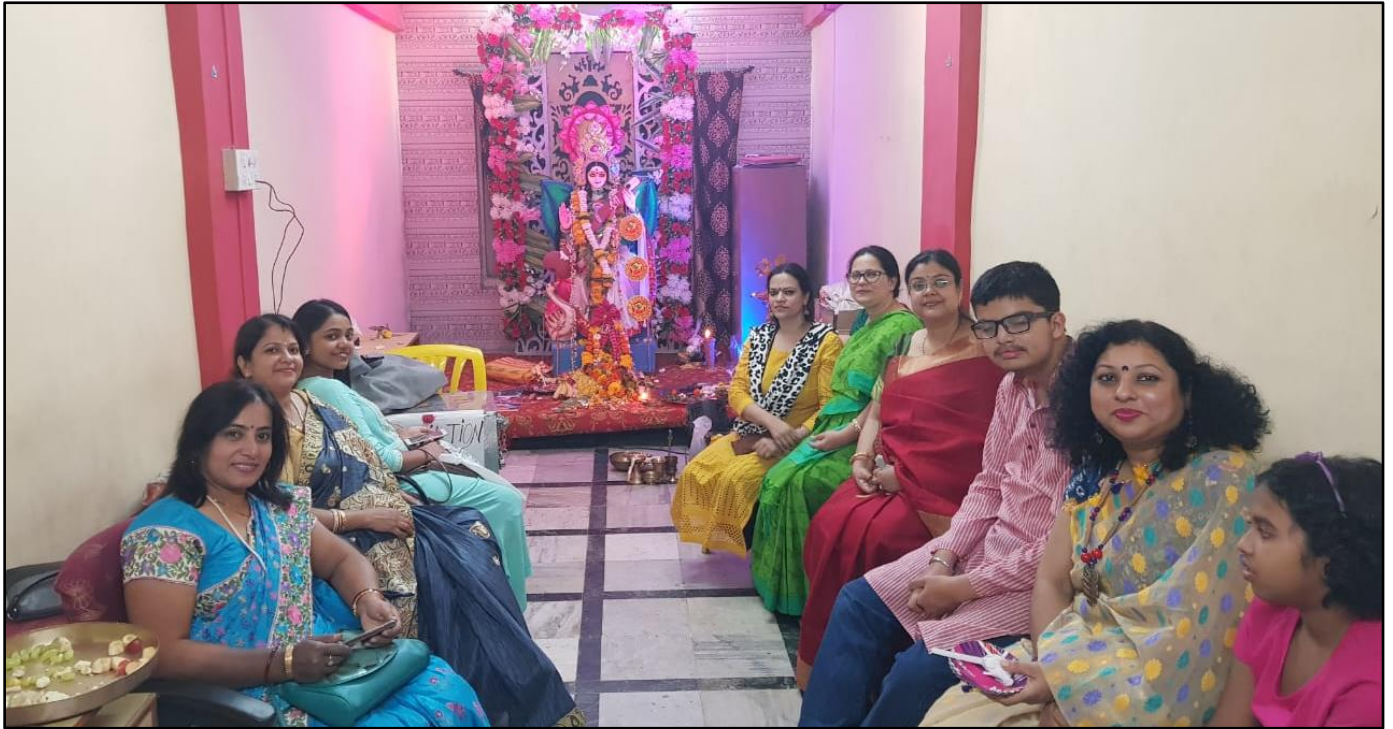
A literary adda organised on the occasion of Basants Panchami at the BMS office in Vakola.