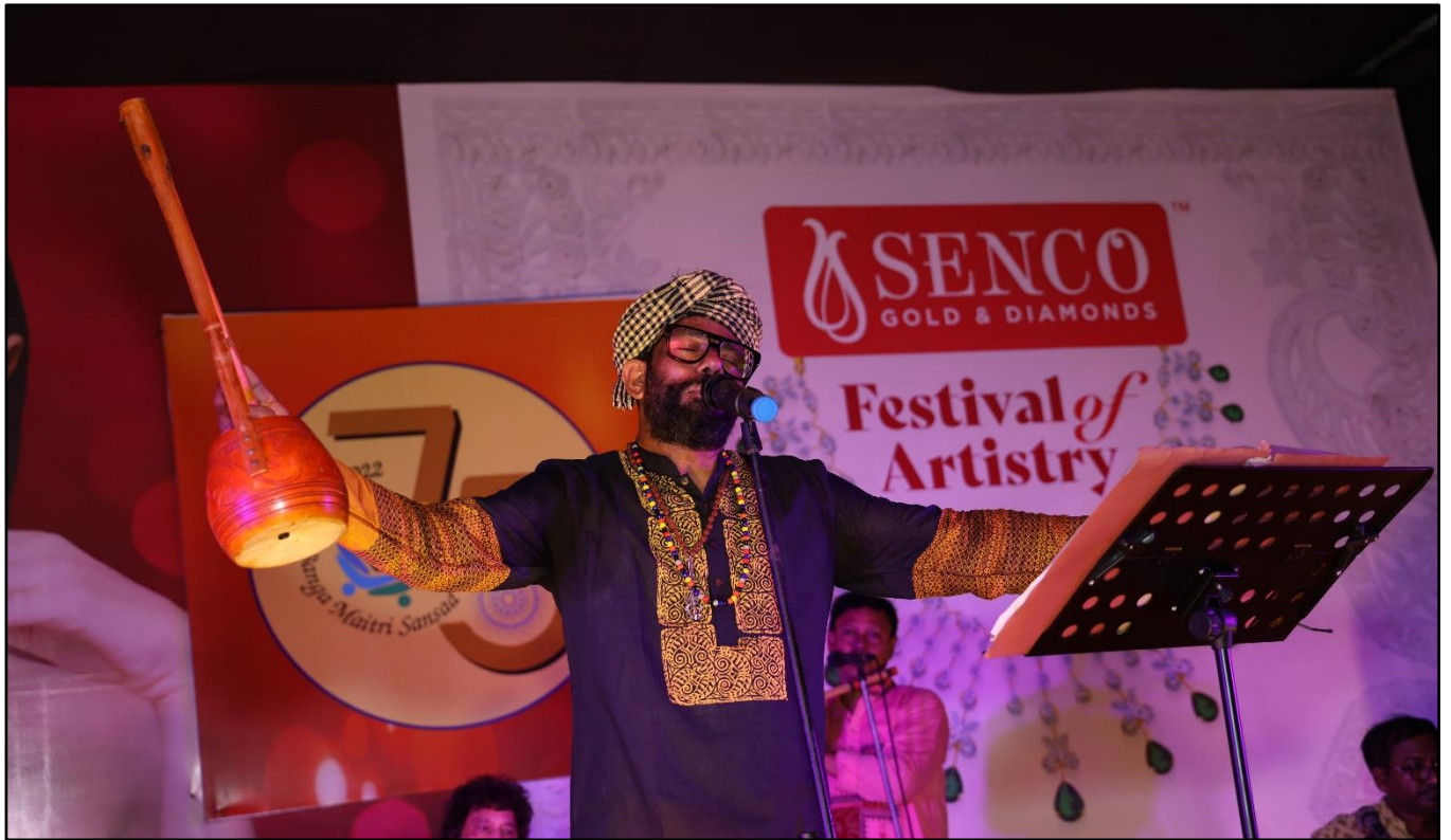
A folk singer from an interior village of West Bengal was invited to perform at the BMS Durga Puja in 2022.