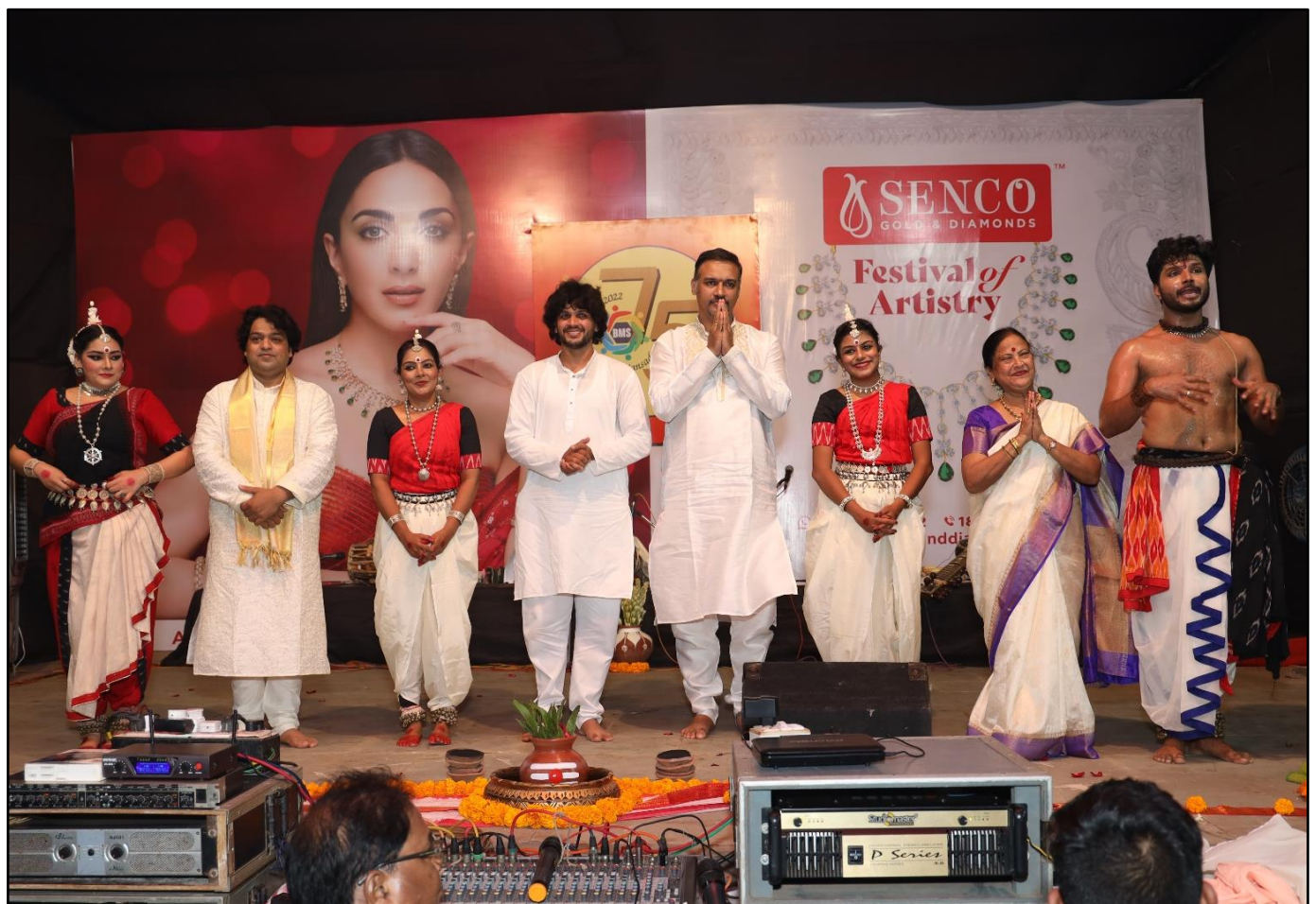
A Classical Dance Group accompanied by pandits of Indian Classical Music performed at the BMS Durga Puja-2022.