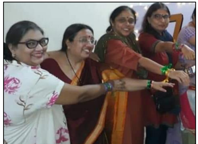
Joint celebrations of Rabindra-Nazrul Jayanti and Friendship Day at the premises of BMS office in Vakola.