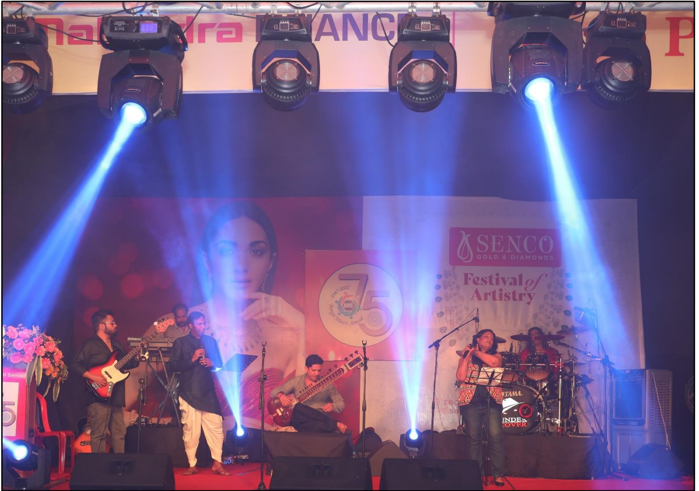
An upcoming Mumbai-based Indo-western fusion music group performed at the BMS Durga Puja in 2022.