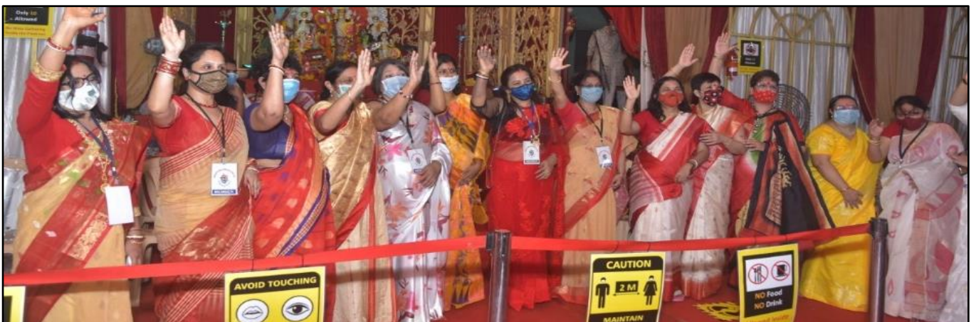
The lady COVID warriors of BMS, who were the volunteers to implement COVID-19 protocols at the Puja mandap in 2021. They distributed masks and santiser in the mandap and kept vigil in groups for implementation of social distancing, screening and non-crowding protocols. It was because of their efforts not a single Corona positive case was reported from BMS after the end of the Durga Puja festivities in 2021.