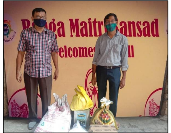
Ration donated to NGO Support Foundation in 2020.