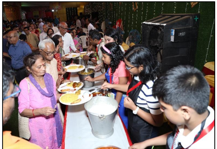
No food was distributed to the public in 2020 due to pandemic-related restrictions. Food packets were distributed in 2021 (left photo) and a record number of people were provided free afternoon meal at the BMS 75 th Year Durga Puja Pandal in 2022 (right photo).