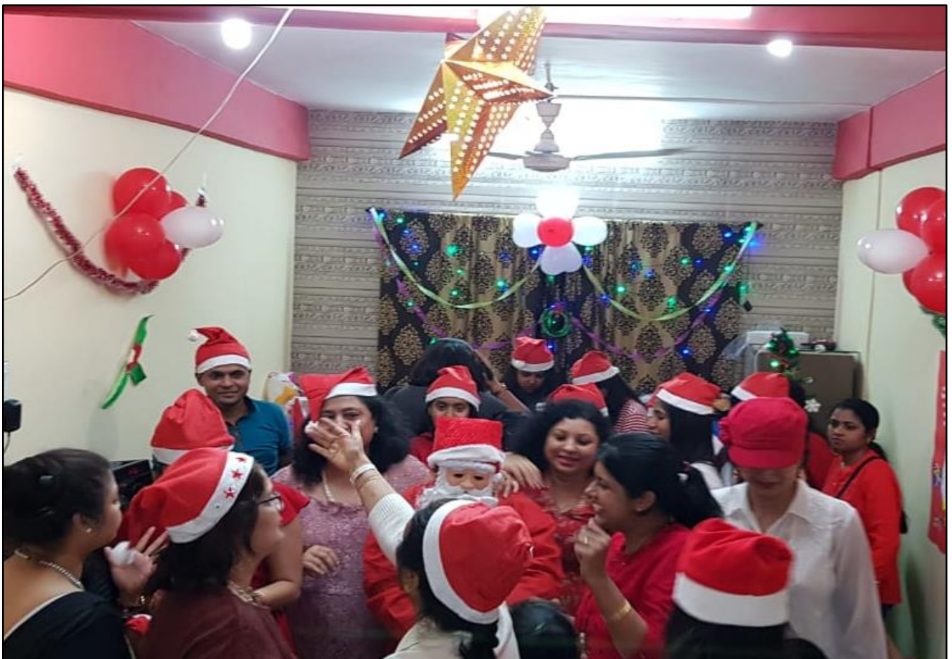
Celebrating Christmas with Santa Clause at the BMS office premises in Vakola.