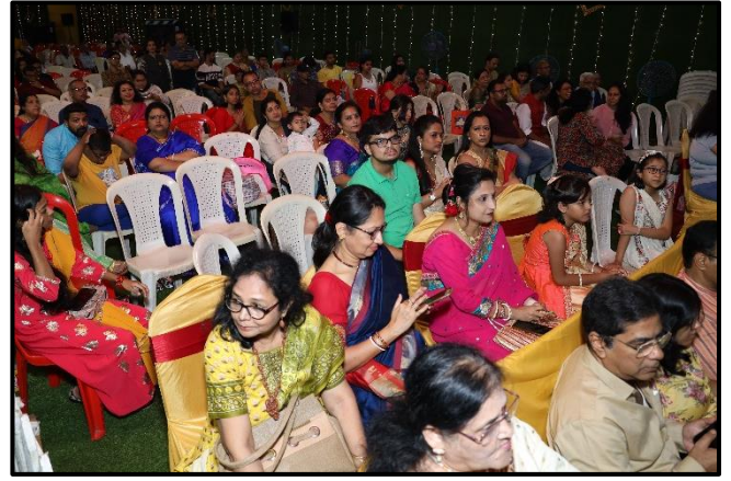
(Top left pic) Devotees gather for Bodhan , Amantran , and Adhivas , the most important rituals on Soshti – marking the beginning of the 5-day long Durga Puja festival. (Top right pic) A large audience thronged the BMS Puja on Soshti evening for a colourful cultural by BMS members.