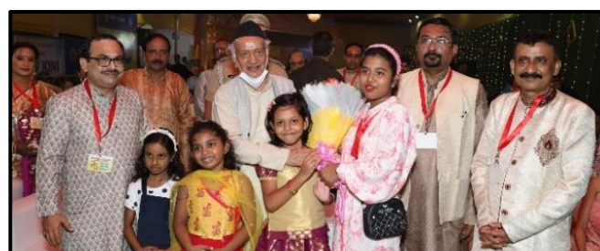
Honb'le governor with young members of BMS.