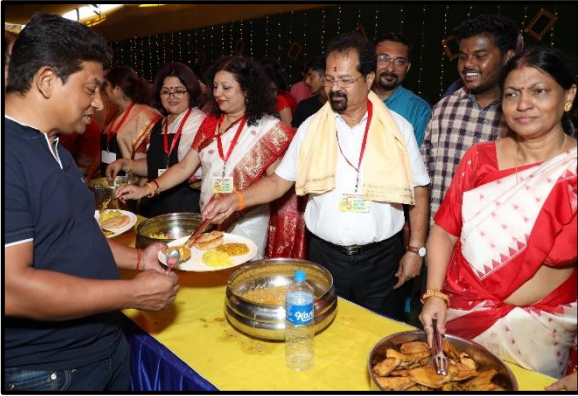
Mr. Vishwanath Mahadeshwar, Former Mayor of Brihanmumbai Municipal Corporation, serves bhog to devotees at the BMS Durga Puja on Ashtami

(Visits of Dignitaries & Cultural Programmes on Ashtami-Oct 3 rd , 2022)