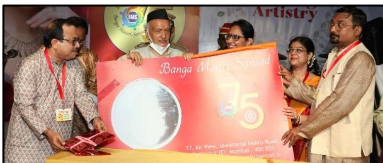
Honb'le governor releasing the BMS commemorative 75 th Year Silver coin.