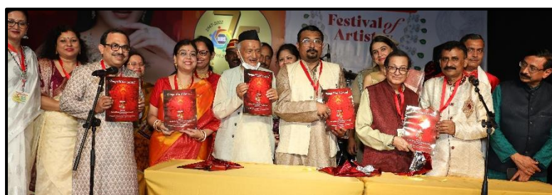
Honb'le governor unveiling the 75 th Year Edition of BMS souvenir,