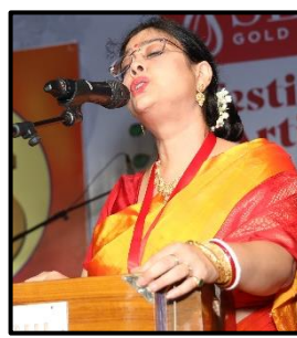
A cultural presentation on the theme "Flavours of Bengal" was presented by BMS members in honour of the Maharashtra Governor.