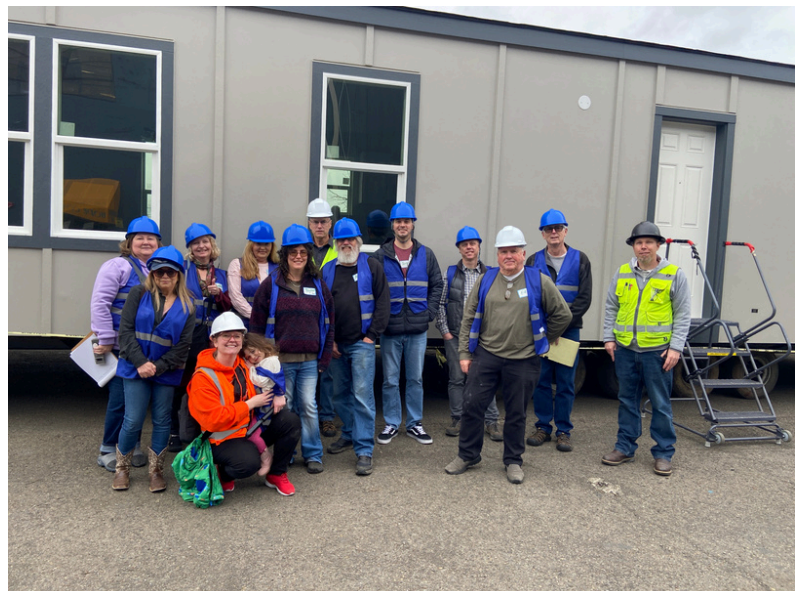
Thirteen First Step board members, staff, volunteers and AWB project manager toured the Hope Community Homes construction site and classroom in Eugene on February 13th.