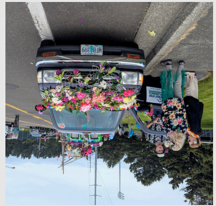
Watch for FSF "Gathering to Build" float in the May 17th Rhody Parade!