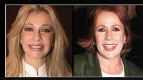
@ MapsofVVorld 2014

Former Miss Venezuela kidnapped and released 3 hours later, after signing autographs for the kidnappers in 2003