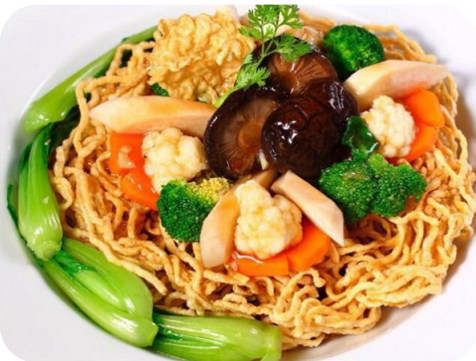
Special Crispy Chow Mein