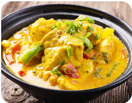
Curry Chicken Soup

Please inform us if you have any allergies All our dishes cooked by order, longer waiting may occur during peak hours and weekend