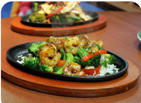
Sizzling Veggie Black Bean Sauce