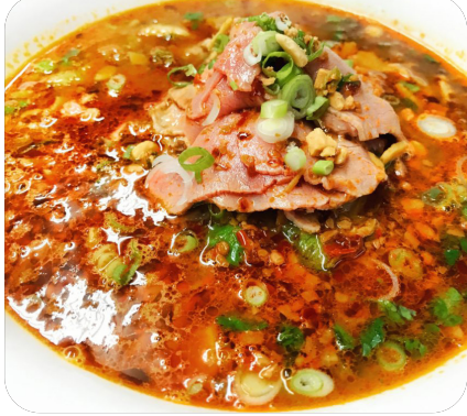
Satay Soup with Beef