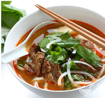
#20 - Central Spicy Noodle Soul