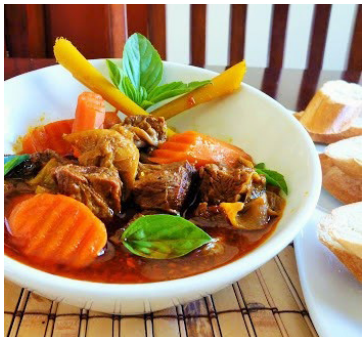
#27 - Vietnamese Beef Stew