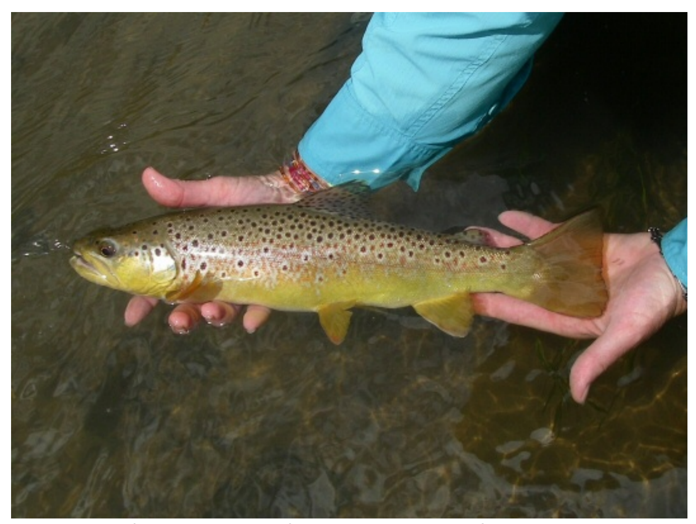
Gina's 16 inch Brown from the West Fork of the Kickapoo