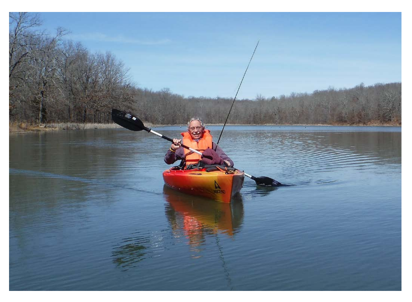
After I finally quit messing with the crappie and bluegill I had to bum a fly since they wouldn't touch a thing I threw at them. SCORE!! AND a couple too many misses.