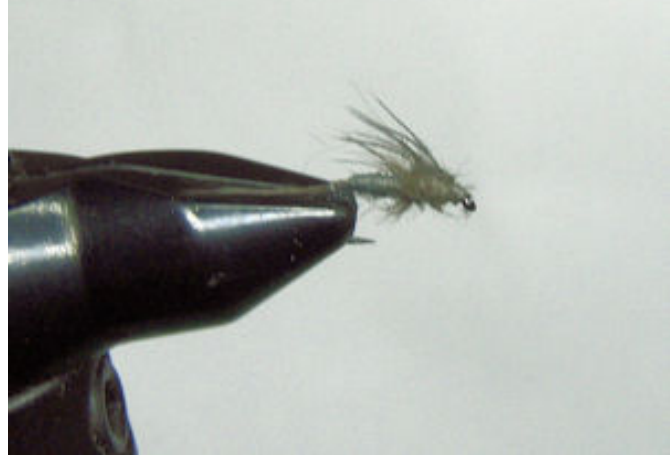
Size 18 brown & Tan trout crack