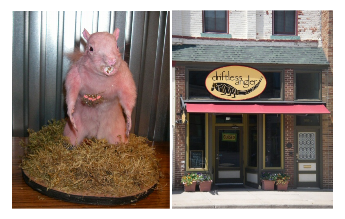
"Pinky" the pink Squirrel