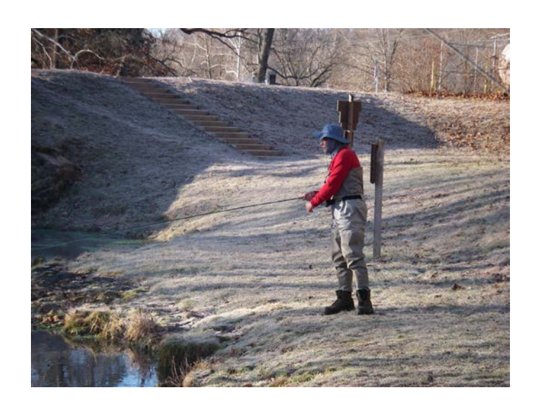
Eye tags by Sam