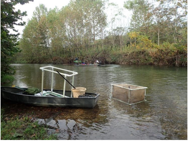
I didn't take photos of the actual measuring, and marking process, as I was helping with that procedure. The generator on the boat transfers the electricity to the probes