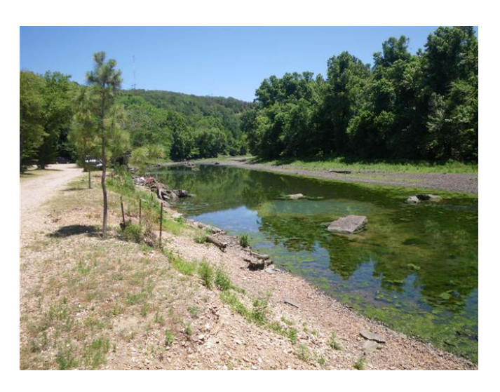
...but fish were available

Oklahoma The Lower Illinois below Tenkiller Dam; no units running