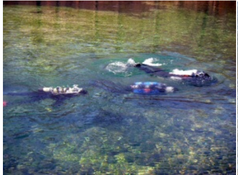
Diver hatch at the Spring

What a nice turn out for our annual Freeze Your Trout Off. Boot, Todd, Patrick, Chris and myself showed up for what turned into - weather wise at least, a very pleasant day to be on the water. We were actually able to practice our casting almost all day without the interference of those pesky trout getting on our flies. If you are not at least chuckling by now you may need to lighten up a little before Thursday - more on this later.