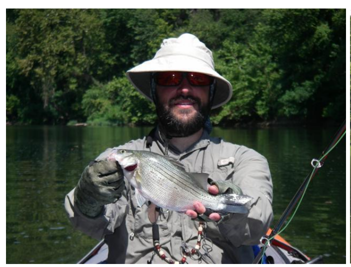
Possible white bass? You betcha!