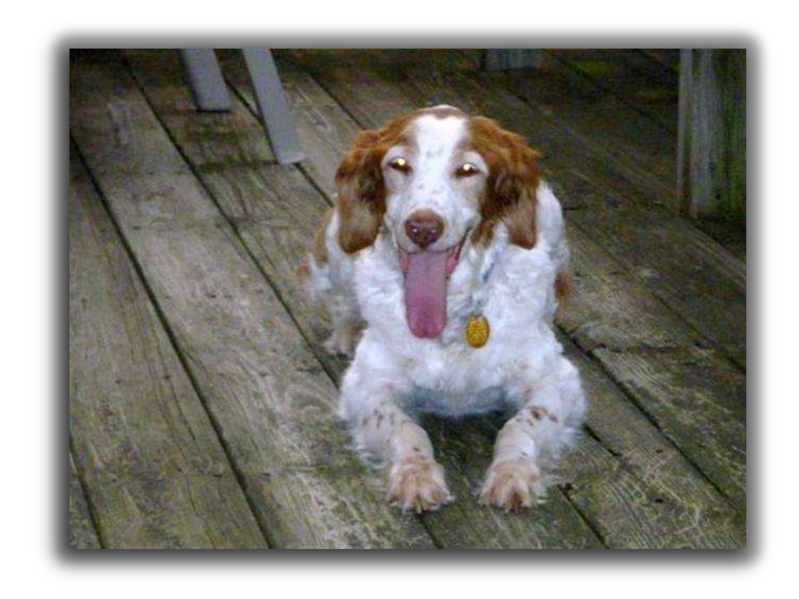
In memory of Jake, 20 Dec 2011

Preliminary scheduling has begun for a Tying 101 class to start in late February. Then in April we'll follow it with Fly Fishing 101. Actual dates have not been locked in.