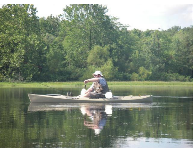
DJ stays upright on Towel Lake