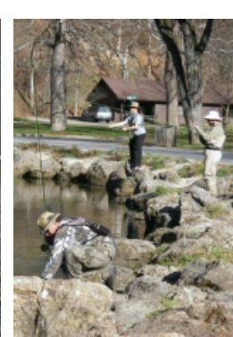
Boot landing one