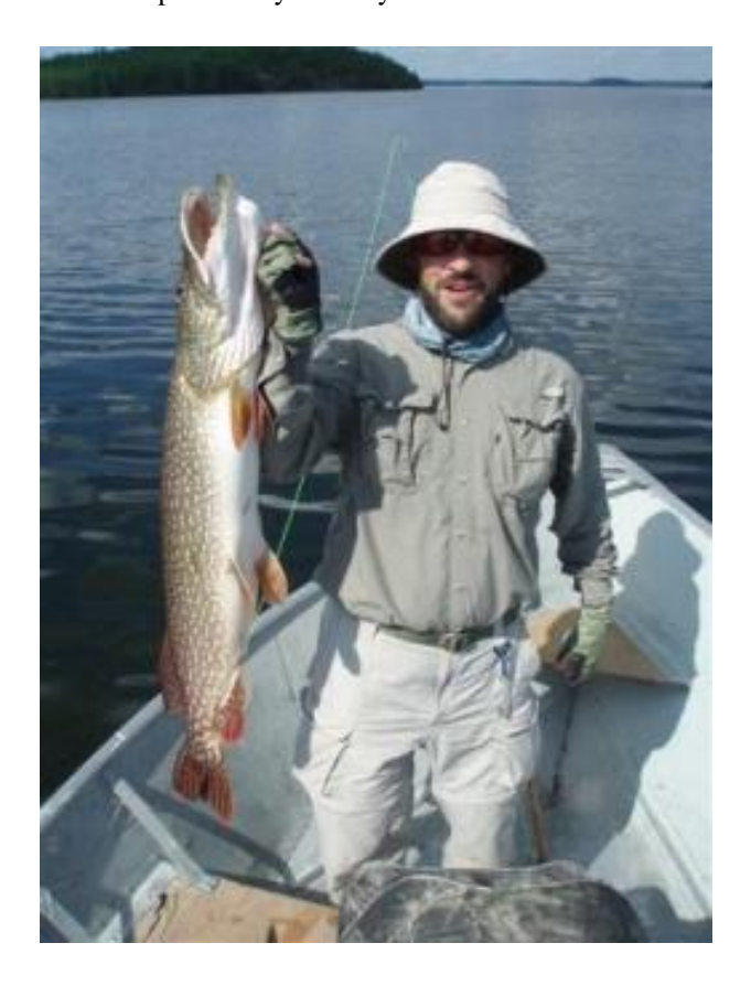
Note to Todd: Nobody likes a smart-ass!

Canada That's a 46", 30lb female northern pike. She took a 4/0 pike bunny tied in yellow and red. 'nuff said.