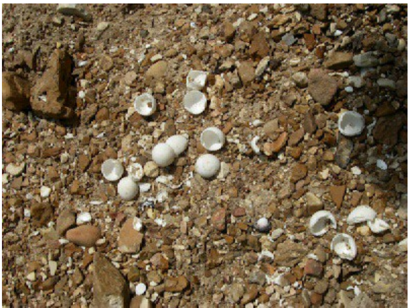
Turtle egg shells