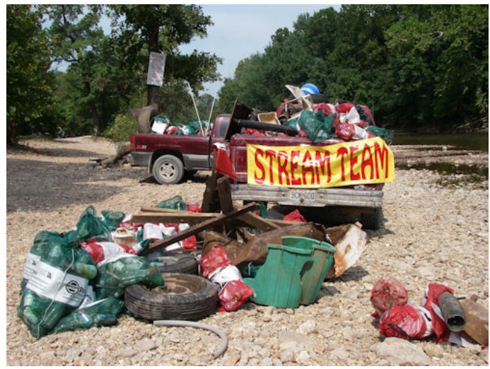
Sunday Todd and Lou helped out on a stream