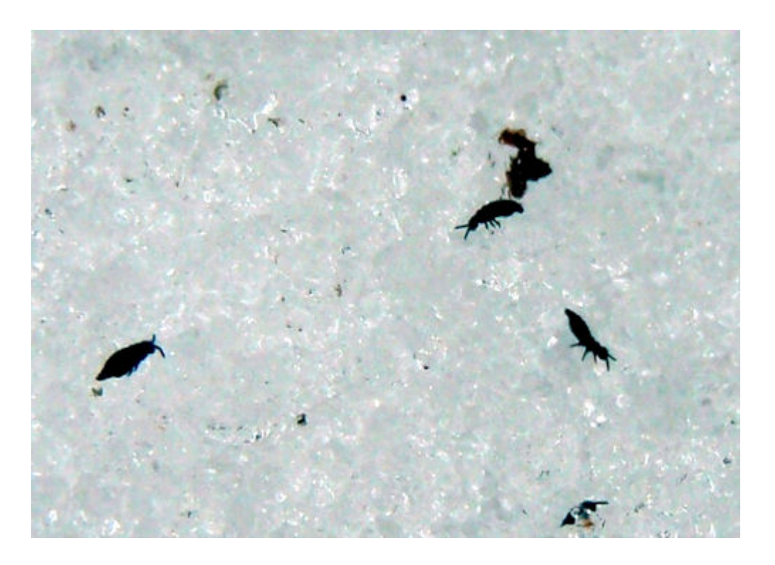
A closer look of the bugs... they are called Springtails.