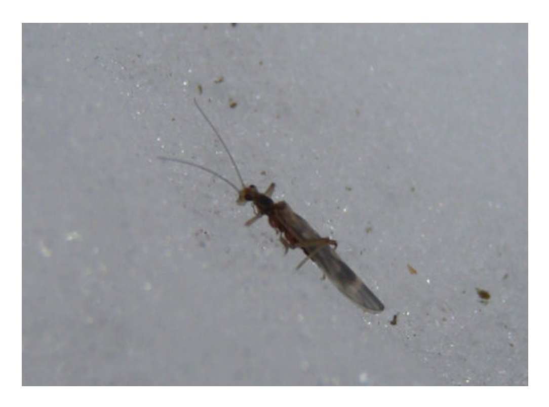
Stonefly hatch about a size 14 black. I saw a few, and I found out later that there was a massive hatch up stream about 10 miles.