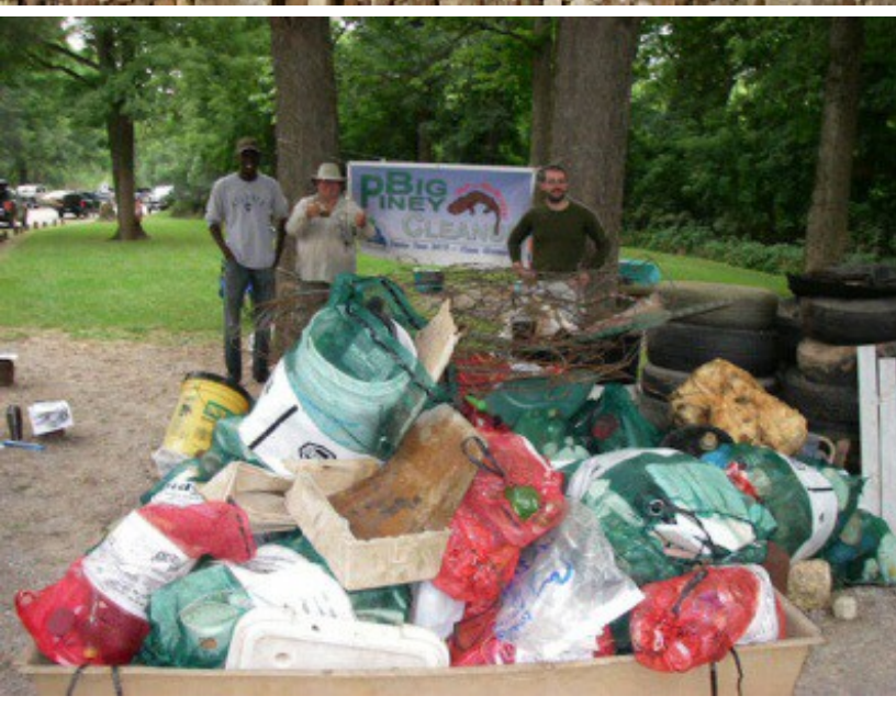
Big Piney Clean-UP