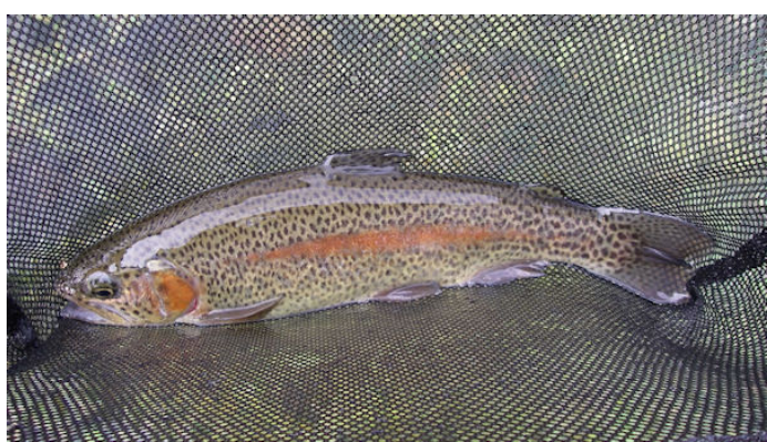
Boot lands another one