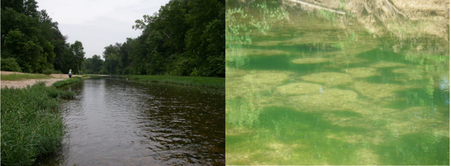
Kings river LongEar spawning beds

Fished the Kings River with friends the 1st & 2nd of Aug. The upper Kings was in typical low water mode – large deep pools connected by short runs. We walked upstream for about a half mile and found a beautiful long deep hole at the bottom of a bluff. Good chunk rock and it was hard to get the fly past the mean green sunfish so the smallies could get to it. Spooked a couple really good smallies. Also caught a real neat rock bass and a bunch of longear sunfish. Saw a HUGE bunch of beds – not sure if the longears were having a second season or this may have been their first.