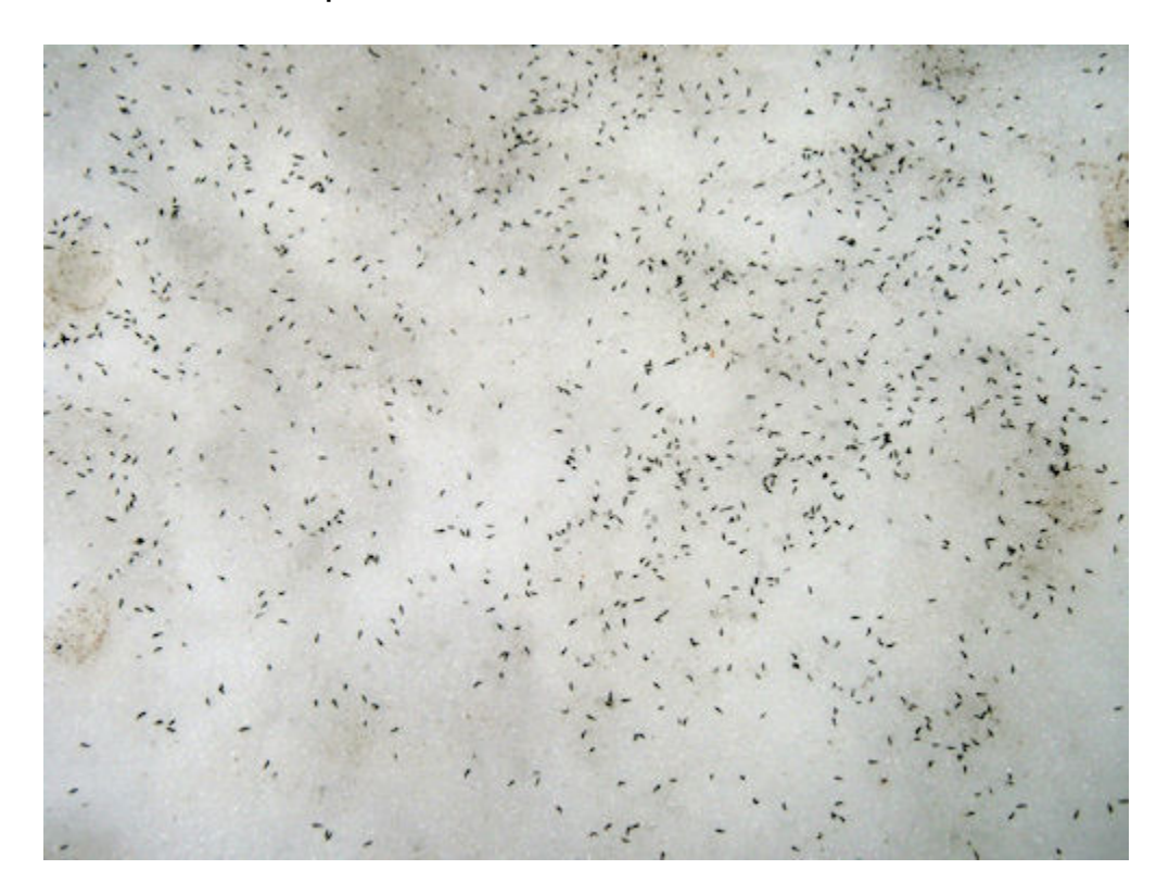
Looks like dirty snow, but they were millions of bugs on the forest floor