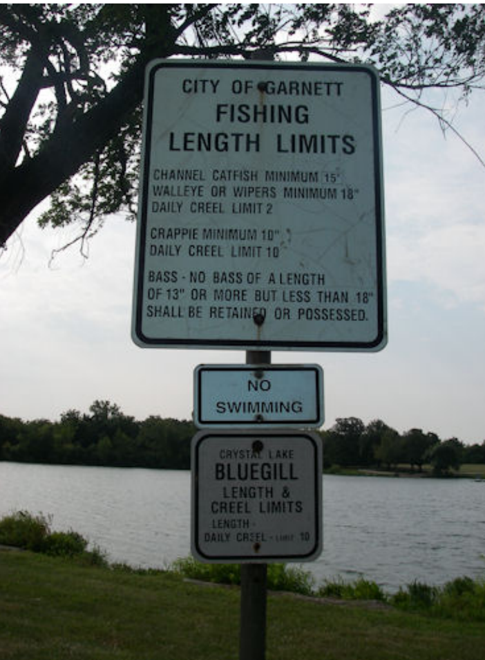
Bob pond largemouth