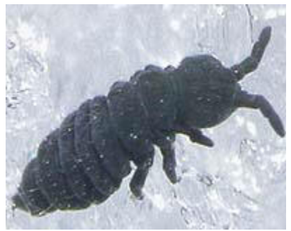
magnified view of a Springtail.