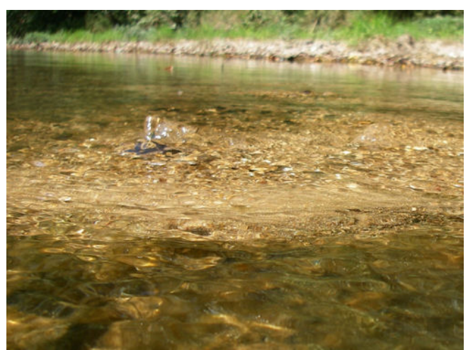
Spring bubbling up in the middle of the Meramec River