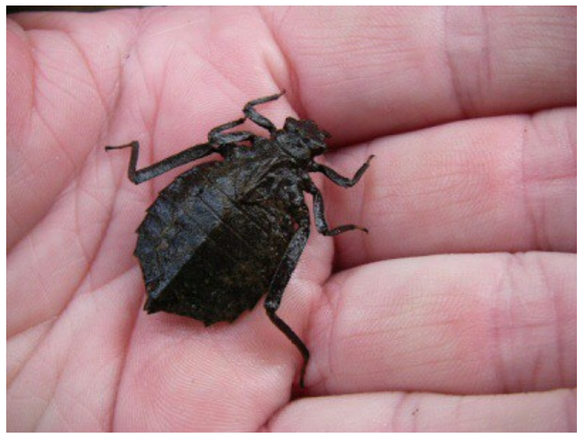
Dragon Fly "Big Ugly"