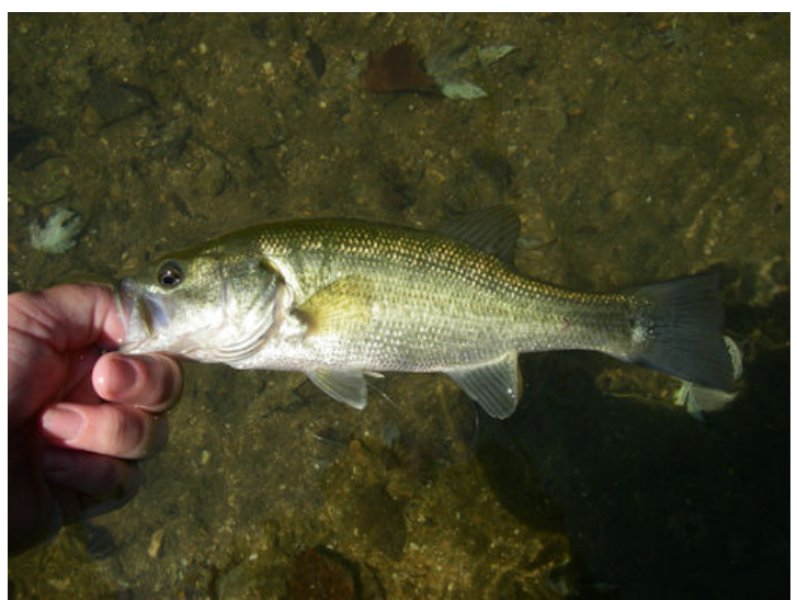
Pale color largemouth

Todd and Lou met up to fish the Meramec River above the Hwy 8 access. The fishing was really slow, hardly a bite below the bridge. Signs were everywhere of it having become a party area so we will blame our lack of success on that. Todd finally hooked into a smallie and I got a few nibbles but nary a fish to hand. We decided to just walk upstream till we either 1) found fishing looking structure, 2) it got too skinny, or 3) an hour had passed, whichever came first. Luckily for us we did pass some fishy looking water, saw some decent sized fish and still walked upstream for almost an hour till the water got too skinny. Once we turned and headed back down stream our luck improved substantially. We caught all the usual suspects – longear sunfishes, a few big shiners, smallies, rock bass some largemouth bass and surprise surprise a spotted bass. A great day to be on the water!!! Todd and Lou drove over to the Niangua river to help with their stream clean on the 8<sup>th</sup>.