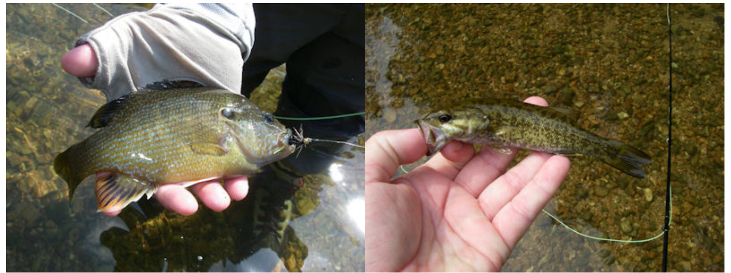
So how low was the Kings? Some outfitters had closed up for the season; one would shuttle your vehicle but would not launch anything of their own. And you had to leave room in your car for the shuttle driver to drive your vehicle to the take out. As low as it was it was nice to have the King's to ourselves.