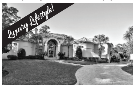
Estates of Northgate Forest | 16815 Southern Oaks $1,345,000 | MLS# 30569041 Absolutely struming custom home! Situated beautifully on lake and golf course. Walls of windows with views of pool, golf course, lake and #1 tee of Creek course.

Waterford Park | 15334 Climbing Branch $375,000 | MLS# 56080696 Exceptional 5 bedroom home in private enclave. From the beautiful interior all the way through the lush backyard paradise with pool and spa, this house is a must see!! 4 car garage!