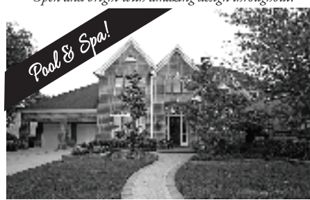
Waterford Park | 15334 Climbing Branch $375,000 | MLS# 56080696 Exceptional 5 bedroom home in private enclave. From the beautiful interior all the way through the lush backyard paradise with pool and

spa, this house is a must see!! 4 car garage!