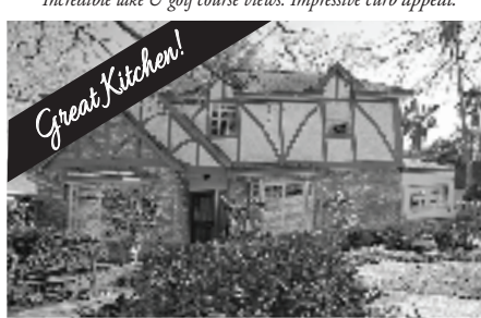
Olde Oaks | 15006 Lantern Creek $230,000 | MLS# 93227424 Nestled in a wooded lot & quiet street. Beautiful bay window and dental crown molding. Nicely updated kitchen, large breakfast area.