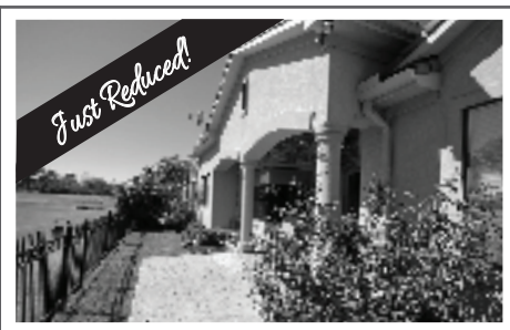
Northgate Forest Place | 16115 Villa Fontana $485,000 | MLS# 46763733 Located in Villa Verde a gated enclave of Northgate Forest. Single story with gorgeous golf course and water views. Open and bright with amazing design throughout.

Please contact me today if you are interested in buying or selling your home.