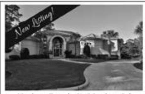
Northgate Forest | 16815 Southern Oaks $1,395,000 | MLS# 30569041 | 7776 SqFt Ainelisely strength cutterf Streeted beautifully on the Orek and