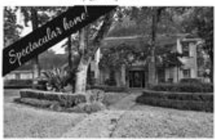
Lakewood Forest | 11218 Lorton Drive $412,000 | MLS# 15630991 | 3958 SqFt Updated to the max imide and out! Beautiful grounds with pool. Rear entry garage, gased drive, extra parking.