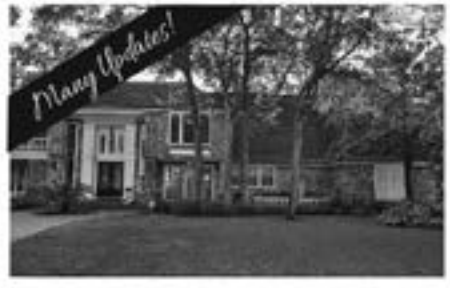
Northgate Forest | 17402 Cedar Placid $549,000 | MLS# 62651790 | 5395 SqFt Impressive 4/4.5/3 home on quiet street. Many great updates!