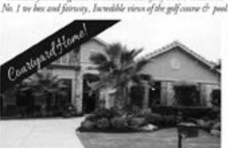
Northgate Forest Place | 16131Villa Fontana Way $615,000 | MLS# 84301031 | 4217 SqFt Gazed enclave of Villa Verde with beautiful views of golf course. Truly a special home.