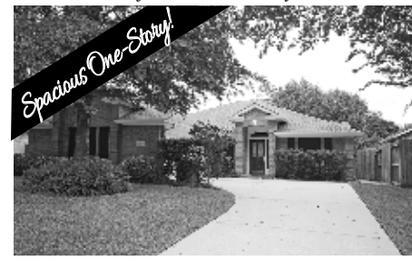
Lakewood Grove | 15906 Timbergrove $235,000 | MLS# 41460763 Spacious one story in Lakewood Forest. 4/2.1/2 with large open living area.

Northgate Forest Place | 16131Villa Fontana Way $599,990 | MLS# 84301031 | 4217 SqFt Exquiste home with attention to detail and design. 3/3.5/2 in gated enclave of Villa Verde in Northgate Forest Golf Course and Country club area.