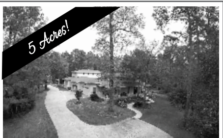
High Meadow Ranch | 28933 Post Oak Run $845,000 | MLS# 51546576 Secluded in country setting. Custom 1 story with courtyard, casita with 4319 sq. ft. Sparkling pool in park-like yard. Tree orchard.