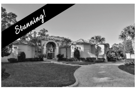
Northgate Forest Place | 16815 Southern Oaks $1,395,000 | MLS# 30569041 Absolutely beautiful 4 bedroom home. 4 full &2 half baths. 4 car garage. View of golf course and pool are fabulous! Over 7700 sq ft.