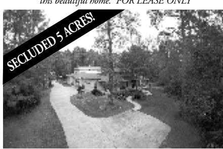
High Meadow Ranch | 28933 Post Oak Run $845,000 | MLS# 51546576 | 4319 SqFt One story Main house (4319 SF), guest house (1800 SF) Very nice property with pool and spa.