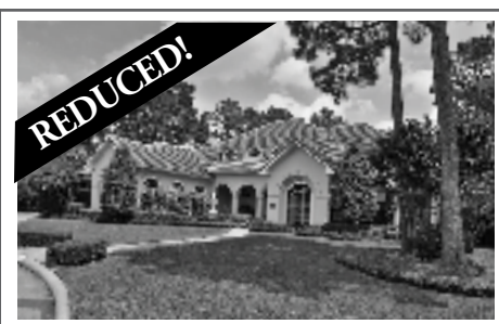
Estates of Northgate | 16810 Southern Oaks $829,900 | MLS# 28245489 | 6234 SqFt 5/5.5/3 in Country Club and Golf Course community. Impressive golf course views. Gated.

Please contact me today if you are interested in buying or selling your home.