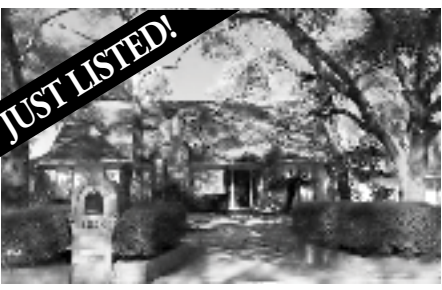
Oak Creek Village | 3850 Woodbriar Dr $189,900 | MLS# 17350446 | 2771 SqFt 4/2.5/3 on large corner wooded lot. Recent updates. 2 bedrooms down