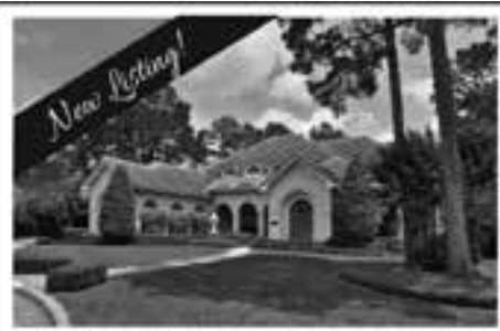
Gated Ests of Northgate Foest | 16810 Southern Oalis Dr $849,500 | MLS# 28245489 | 6234 SqFt Incredible lake & golf course views / high ceilings, hardwoods & pulladian windows.