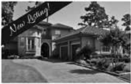
Northgate Forest | 16126 Villa Fontana Way $527,500 | MLS# 44099145 | 3540 SqFt Custom Mediterranean courtyard villa / Lanai with outdoor kitchen / Viking appliances.