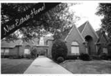
Olde Ouks | Just Reduced | 15214 T C Jester Blvd. $425,000 | MLS# 20036267 | 5586 SqFr 4/4.2/3, 2 lots, pool, spa. tock waterfall & slide / Updated island kitchen.