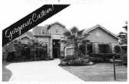
Northgate Forest | 16131 Villa Fontana Way $615,000 | MLS# 26552847 | 4217 SqFt 3/3.1/2 / Golf Course views. Professionally decorated and Landscaped.