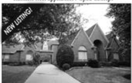
OLDE OAKS | 15214 T C Joster $450,000 / MLS# 20036267 / 5586 SqFt 4/4.2/3, 2 loss, pool, spa, rock waterfall & slide / Updated island kischen