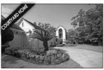
NORTHGATE FOREST | 2719 S Southern Oaks $520,000 / MLS# 66304691 / 4058 SqFt Secluded wiGolf course views / 23ft harveled ceiling, floating staircase / quality finishes

281.433.2087 lbeck@garygreene.com www.LindaBeck.com