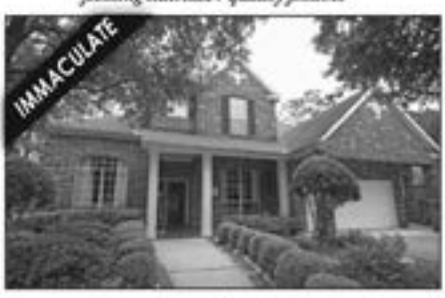
WATERFORD PARK | 15314 Beecham Dr 5290,000 / MLS# 39505384 / 3760 SqFr 4/5 Beds + 4 full baths / Immaculate & versatile home / 3 car garage / can be 2nd bed down / Private backyard