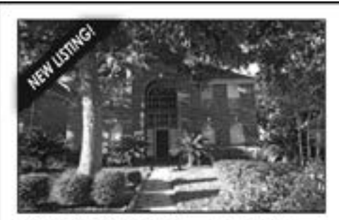
OLDE OAKS | 15015 Dawnbrook Drive $198,000 / MLS# 39711291 / 2924 SqFr 4/2.1/3, Updated kitchen, granite and stainless steel appliances / Open Concept