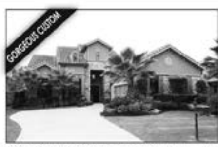
NORTHGATE FOREST | 16131 Villa Fontana Way $625,000 | MLS# 26552847 | 4217 SqFt Golf Course views. Professionally decorated and landscaped

281.433.2087 lbeck@garygreene.com www.LindaBeck.com