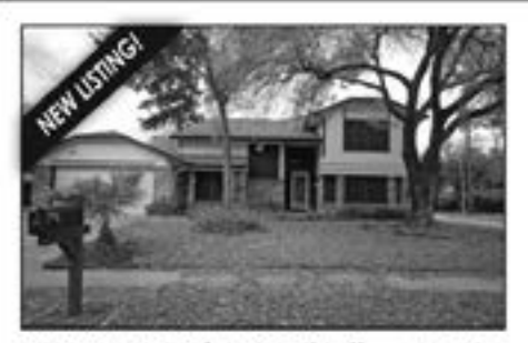
STEEPLECHASE | 11302 Chiselburst Way Ct $185,000 / MLS# 3969737 / 2876 SqFt 4/3/2 Completely remodeled / $60 in upgrades. Versatile floor plan